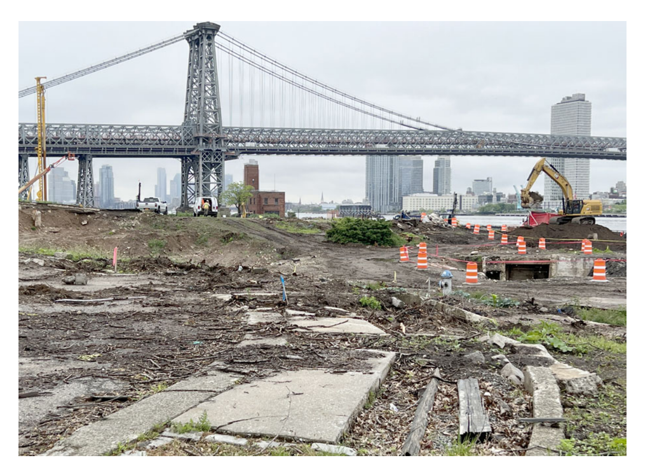
Fig. 2. Demolition of the southern end of East River Park. Photo taken by the author, 19 May 2022.

a dynamic and unstable Lower East Side, Myles links earlier emplaced queer affects to the affective experiences associated with climate emergency. As Sara Ahmed argues, "Bodies take the shape of norms that are repeated over time and with force" (145). For Myles, their body took shape in response to the normalized infrastructure of loss caused by the city's prioritization of real estate interests and disregard for people with AIDS. The norms embodied by these losses shape how they confront the loss of East River Park.