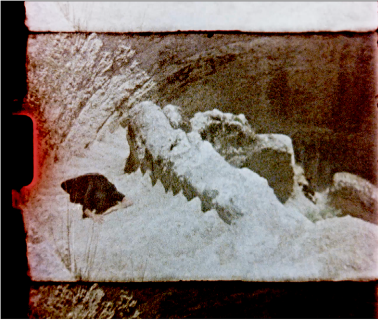
Still from Our Songs Were Ready for All Wars to Come (2021).

aim is to decentralise images of fixity while at the same time foregrounding the gaps, silences, and absences those fixed structures produce. 16