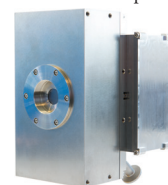
pnCCD Color X-ray Camera