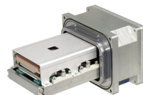
pnCCD (S)TEM Camera