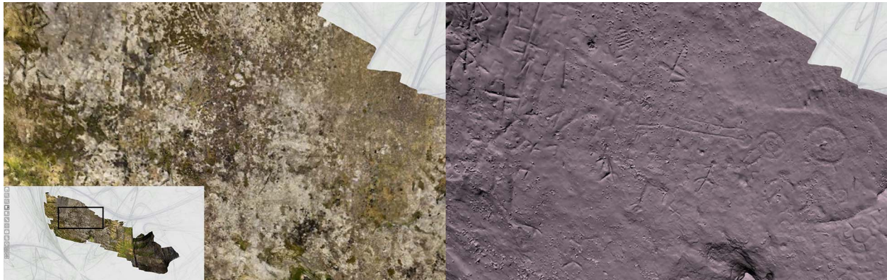
Figure 1. Photogrammetry model of a petroglyph panel from the Edgemont Shelter, Arkansas, published online using 3DHOP. Left image shows the model with color, with the petroglyphs obscured by heavy lichen growth; right image shows the same view of the model with the color stripped, and lighting source location adjusted to highlight the shallow topography of the petroglyphs. The additional visibility from photogrammetry, and the manipulation and viewing of the model online, speaks well to the benefits of photogrammetry and of online presentation for communication and exploration beyond what is possible in person. Lower left insert indicates where on the panel the enlarged photographs were taken, although note that the 3D model was rotated given that the petroglyphs are located on an overhang, so the bounding box does not align perfectly. Model created by Malcolm Williamson, Center for Advanced Spatial Technologies (CAST), University of Arkansas.

because the size of spatial data not only is a challenge when approaching archiving but also raises issues with processing and visualization, among other issues. Here, the “DIY” momentum of increasingly accessible spatial methods is examined alongside forthcoming changes in publication policies (especially in the United States), framed around best practices and ethical considerations.