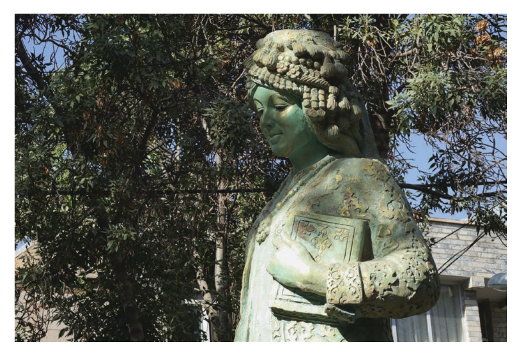
Figure 5. Statue of Mestûre Erdelan (2011) by Hadî Ziaoddînî, erected in a Sine public square, one of the very few public statues of a woman.

(social) right to enter. For example, as the writer Çinar emphasized in our interview, taking pictures was the pretext for her colleague Jana to enter the zurxane , the traditional gym, where only men can go. Çinar: