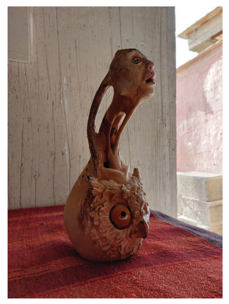
Figure 3. Bad luck (2020), wooden sculpture by Mîran. The owl is regarded as a symbol of bad luck and compared to the alleged bad luck women can bring.

Performing citizenship in Kurdistan further complicates the already doubtful division between public and private spheres. That which cannot become explicitly public is in no way devoid of political meaning. On the contrary, the space of the home and other secluded venues are transformed into meaningful political spaces. These spaces are extended by mobile phones and the internet-for example dancing out of sight of anyone, including the regime, and then publishing a self-made video of the dance online.6