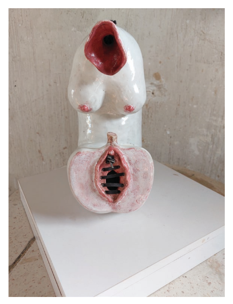
Figure 2. Virginity (2020), ceramic and leather sculpture by Mîran. In his works, the artist refers to women's suffering, lack of sufficient legal protection, domestic violence and sexual abuse, and misogyny in Kurdish and Iranian society.

In order to link Kurdish women's dissent in Iranian Kurdistan with universal women struggles, these actors draw from different local and global sources of inspiration. They challenge the Iranian colonialist regime, which imagines Iranian culture as expressing and producing official Iranian citizenship. The state-imagined Iranian citizens are entitled to interact with the global modern world but only the official Iranian culture and Persian language are deemed to represent all other minor and regional cultures (see Cabi 2021, 2022). While elevating particular forms of Iranian culture, the regime minoritized other cultures such as the Kurdish and Baluchi communities, branding them "backward" and only relevant locally, not as an acknowledged part of a national Iranian culture (see Cabi 2021, 2022). Resisting the regime's designation as "minor," Kurdish women performers attempt to establish a meaningful exchange with global audiences; they play with local as well as international themes. Their strategies correspond with what Hamid Keshmirshekan identifies as a crisis of belonging