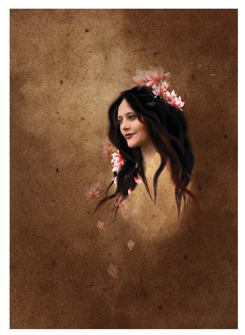
Figure 1. Jîna Aminî (2023) by Rounak Resoulpour, a Kurdish Rojhelati artist currently living in Sweden. The image of the activist, killed in 2022 by Iranian morality police, was widely shared via social media and appropriated as a cover for a Kurdish journal (Bîrnebûn) in Türkiye.

Moving beyond the momentary focus on revolution with its expectation of immediate change, the performances by women of the "feminist revolution" in Iran are part of much more complex phenomena: performing citizenship-a long-lasting and intersectional process involving struggles and achievements of different generations of women. As stressed by Shahrzad Mojab, artistic activity has always been an important part of resistance in the Islamic Republic of Iran, but has only recently caught global attention, thanks to social media (Mojab 2023). Interviews with Kurdish artists, which we conducted in July 2022 on the eve of the dramatic protests in Iran, reveal the artistic engagement of Kurdish women in Iranian Kurdistan (Rojhelat) as a form of