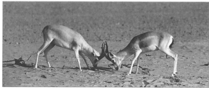
Two male Arabian sand gazelles ( Gazella subgutturosa marica) fighting.