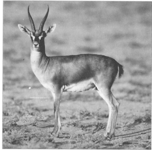
Gazella gazella erlangeri male kept at the NWRC.

It has been suggested that G. bilkis is endemic to Yemen (Groves and Lay, 1985), but no systematic field survey of its range has ever been conducted, and, considering the biogeography of the Asir mountain range and the regional distribution of other species, such as G. g. cora , it is possible that it occurred or even still exists in Saudi Arabia, at least in the south (Groves, 1989).