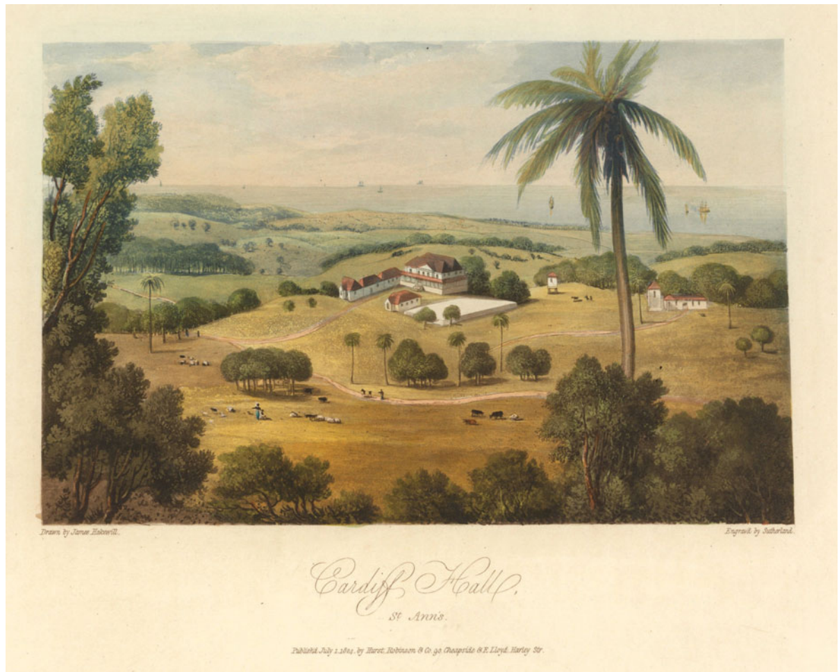
FIG. 1. James Hakewill, “Cardiff Hall.” A Picturesque Tour of the Island of Jamaica , London, 1825, Yale Center for British Art, Rare Books and Manuscripts, T 683 (Fo. A).

appearance in the Plymouth Plan and the first London editions of nearly nine thousand copies, the image was printed in The American Museum (Wood 32), issued as a broadside in Philadelphia and New York (Bernier 996), and distributed in France with the text translated, all within a few months of its first appearance (Wood 19).