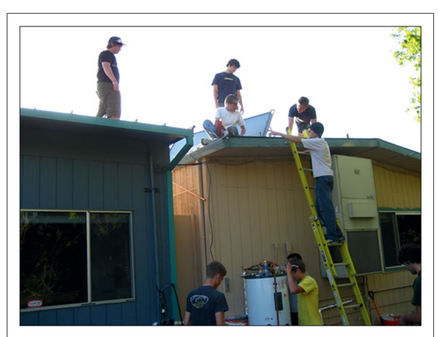
Figure 3. Freshman service learning project with a California K–6 charter school to install a solar water heater. Cal Poly students conducted a user needs assessment and identified the engineering design constraints and requirements to provide hot water to school children to wash their hands and for the science teacher to conduct experiments. They then installed the system and still maintain it.

strikes, and embargos). Current news articles are used to emphasize the topics' relevance, and directed reflection assignments and in-class discussions allow greater opportunity for thought on the impact of engineering on people and the planet. For example, an assignment that has a significant impact on students is a set of articles and photo gallery<sup>12</sup> on the electronic wastes that end up in developing countries. Students make the connection between their latest cell phone and young children exposed to toxic materials in other parts of the world. Likewise, the connection between the demand for rare-earth metals for renewable energy technologies and the devastation of farmland in China<sup>13</sup> requires broader views and systems thinking.