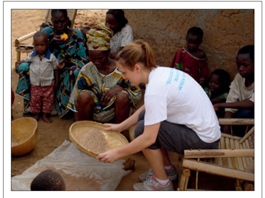
Figure 2. Student working with women in a village in Mali to help determine energy and cooking needs.

It is also important to extend the discussion of sustainable development beyond engineering. To that end, Engineering and Economics faculty have co-created a course called "Globalization and Sustainability" that teaches a systems-level view of sustainable development and is open to all undergraduates. Taught in the "Technology and Social Change" program in the College of Liberal Arts and Sciences, this course includes students from all six undergraduate colleges and from all stages of their undergraduate experience, with enrollment of approximately 100 students. Materials make up an appreciable portion of this class, with a focus on the ubiquity of materials in technology, as well as the scarcity of some resources and how that scarcity can have an impact on future technological solutions for sustainable energy