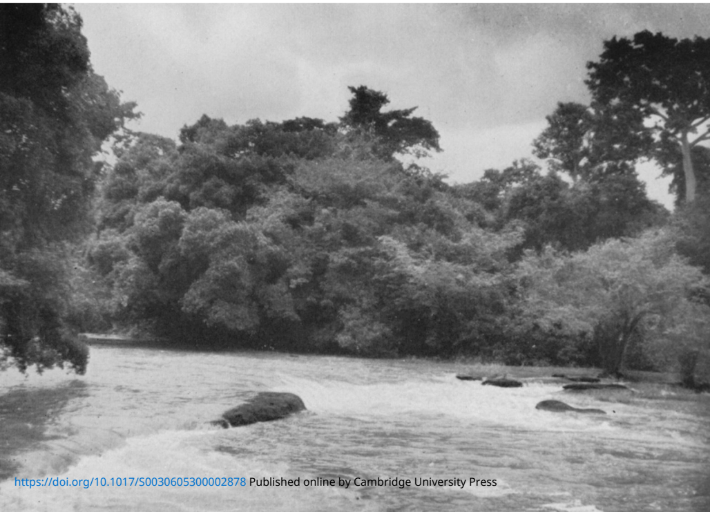
Plate I5: The Afram River. See the article on a new lake in Ghana, page 168.

Plate I4 : Looking towards the southern Afram Plains in Ghana. An infra-red photograph.