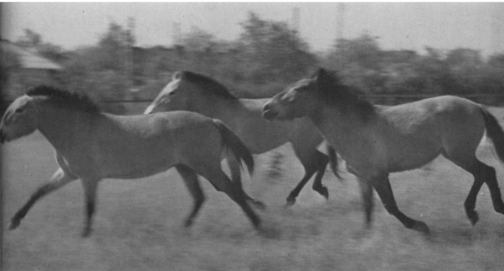
Askaniya Nova Zoopark

Plate 16 : The herd of Przewalski horses at the Askaniya Nova Zoopark in the Ukraine. The only truly wild horse alive today, it is almost extinct in its native habitat in Mongolia. An account of this Russian herd will be found in the recently published International Zoo Yearbook , reviewed on page 185.