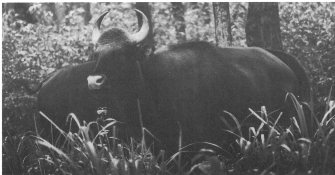
Gaur, one of the most threatened mammals in Bangladesh (N. Sundarraj).

easy victims of slash-and-burn ( jhoom ) cultivation, fleeing from the forest when it is fired to be trapped, killed and eaten. They are crepuscular, living in dense sun grass Imperata arundinacea and difficult to see. They still occur in the northern and eastern forests in the Mymensingh, Sylhet and Hill Tracts Divisions. I estimate a resident population of 50–100, but in scattered groups so that no genetic exchange is possible.