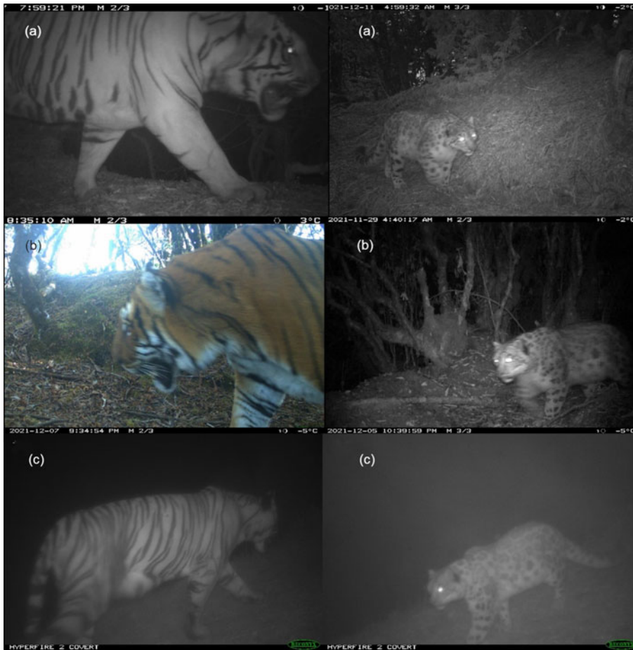
PLATE 1 Images of tigers Panthera tigris and snow leopards Panthera uncia captured at the same camera-trap locations in Jigme Dorji National Park, Bhutan (Fig. 1), at (a) 4,010 m; (b) 3,885 m; and (c) 3,615 m altitude (Table 2).