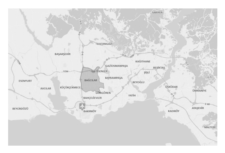
Figure 2. Map showing the location of Bağcılar.

Islamist RP local government in the 1990s. Nevertheless, the narrow surface area (22 square kilometers) and the high population density (33,582 people per square kilometer in 2010) have resulted in unplanned urbanization with informally built attached apartment buildings (which are called apartkondus by the locals) along narrow streets in most neighborhoods of the district. The district's population