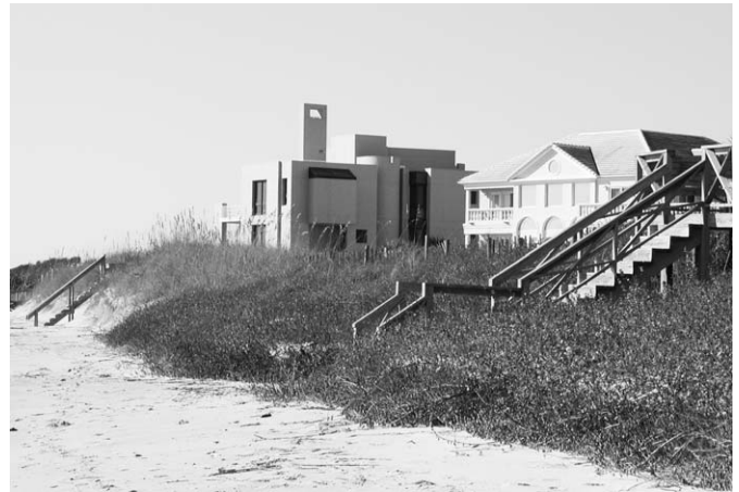
Figure 3. A beach vitex ( Vitex rotundifolia L.)-infested site (right) adjacent to an uninfested site (left) in fall. The delineation between the deciduous beach vitex (dark gray) and the sea oats ( Uniola paniculata L.) (light gray) is clearly visible.

Beach vitex is native to latitudes ranging from 0° to 38° (and potentially further north) (Lee et al. 2007). The range of beach vitex is restricted in that it is an obligate seashore shrub but expansive with regard to climatic tolerance. According to all BIOCLIM (Beaumont et al. 2005) statistics, except those associated with the seasonality of precipitation, the climate at the highest latitude from which the authors have found plant samples (Korea) is similar in many ways to the climate associated with areas near the Connecticut–New York border. The Korean site and the Connecticut–New York border record annual mean temperatures of 11.7 and 11 C, (53 and 52 F), annual precipitation of 1,196 and 1,183 mm, maximum temperature in the warmest month of 27.6 and 28.7 C, and minimum temperatures in the coldest month of –5.9 and –6 C, respectively (WorldClim 2009). It is logical to assume that the maximal extent of beach vitex in the United States should be climatically equivalent to the extent of beach vitex in the Pacific. Under these assumptions, beach vitex is likely capable of growing in Connecticut, Delaware, New Jersey, and New York. Our predictions are limited by the published accounts of beach vitex sightings. Beach vitex may exist at higher latitudes