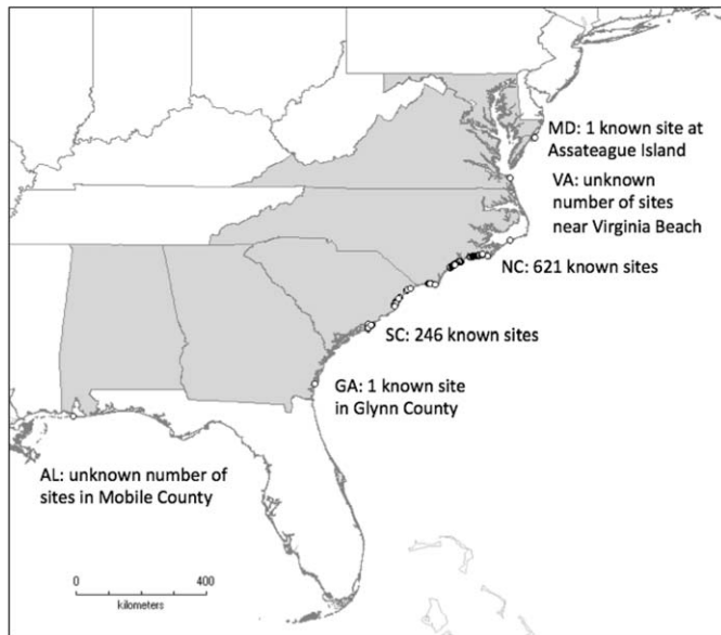
Figure 2. Known distribution of beach vitex ( Vitex rotundifolia L.) in the southeastern United States.

et al. 1999). Globally, according to the Köppen-Geiger climate classification (Peel et al. 2007), beach vitex is known to exist in a host of climatic regions, including three of the six major groups: tropical (specifically, Af, Am, and Aw), temperate (Cfa and Csa), and continental (Dfa and Dwa). It is evergreen in tropical areas, such as Hawaii and deciduous in temperate areas along the coasts of Korea and North America.