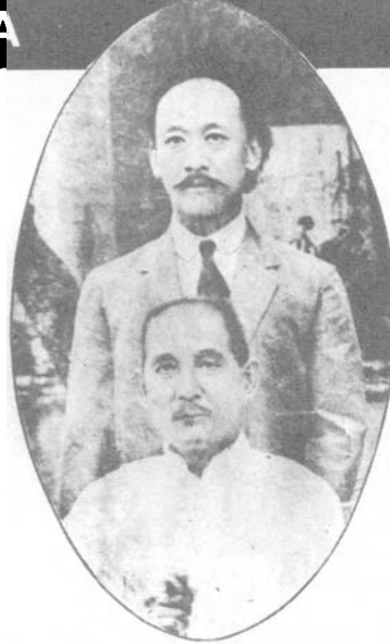
Shen Dingyi standing behind Sun Yat-sen. From Blood Road