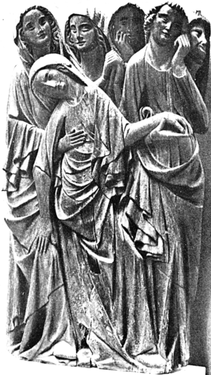
THE SWOONING OF THE VIRGIN