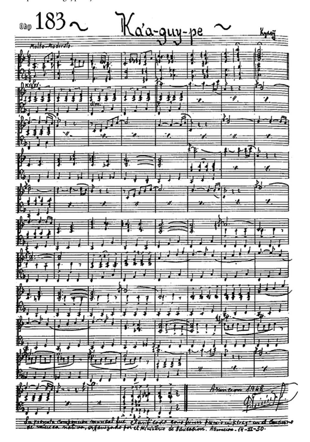
Example 3 'Ka'aguype' by Florentín Giménez.