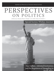
Flooded Liberty Statue in New York, USA.