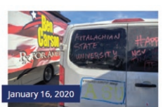
Taking Students to the Iowa Caucus: An Experiential Approach to American Politics