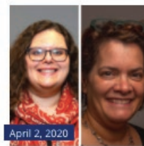
Engaging Student Voters in Pennsylvania