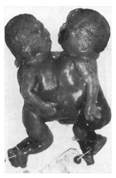
Fig. 1. Stillborn thoracoomphalopagus twins.