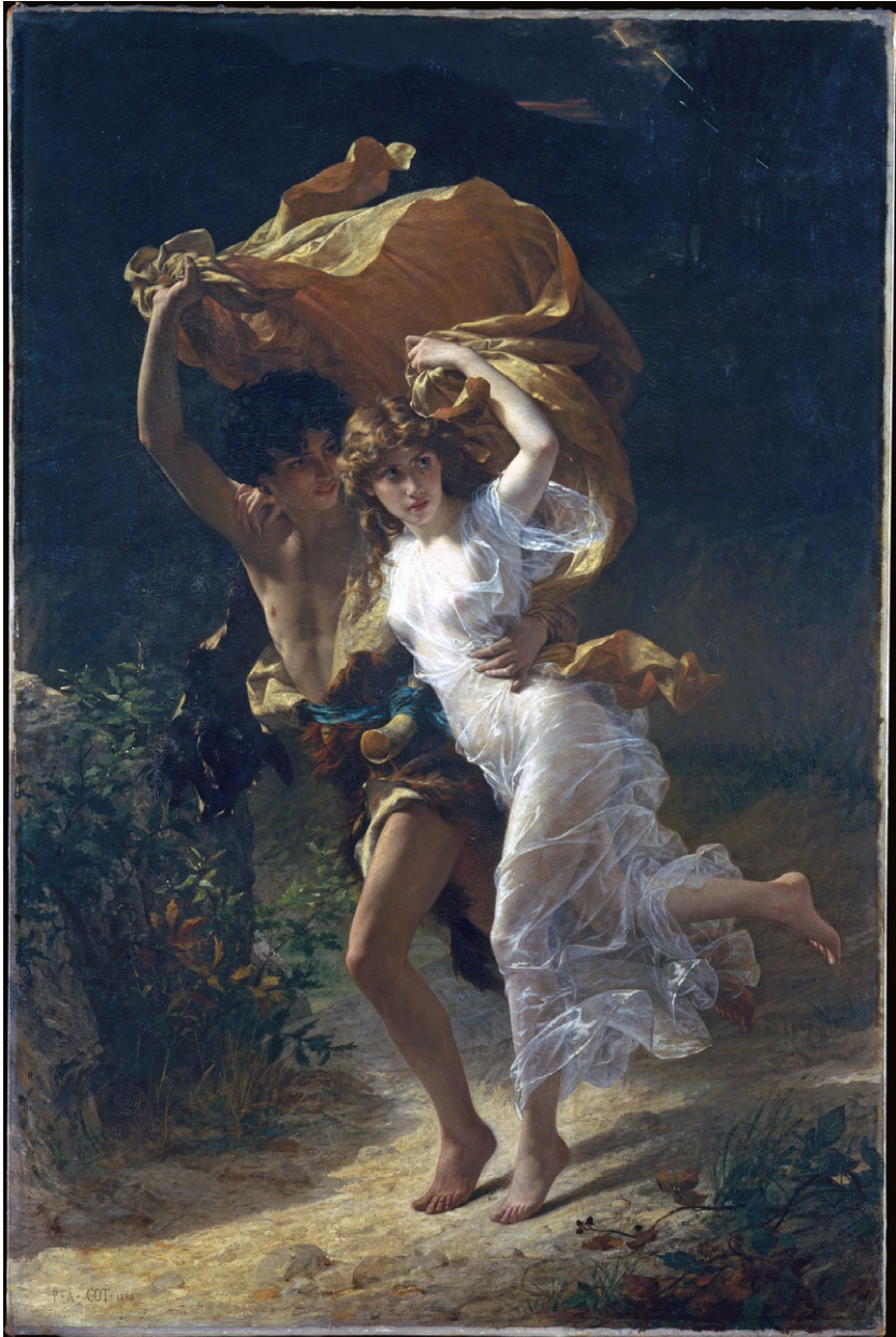
Figure 4.1 Pierre-Auguste Cot, The Storm (1880).