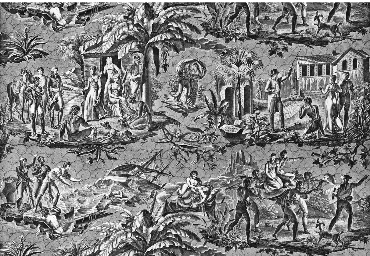
Figure 4.2 Scenes from Paul et Virginie , after Charles Chasselat and Antoine Johannot (1825–1830). Courtesy of the Musées d'Art et d'Histoire, Culture et Patrimoine Ville du Havre.