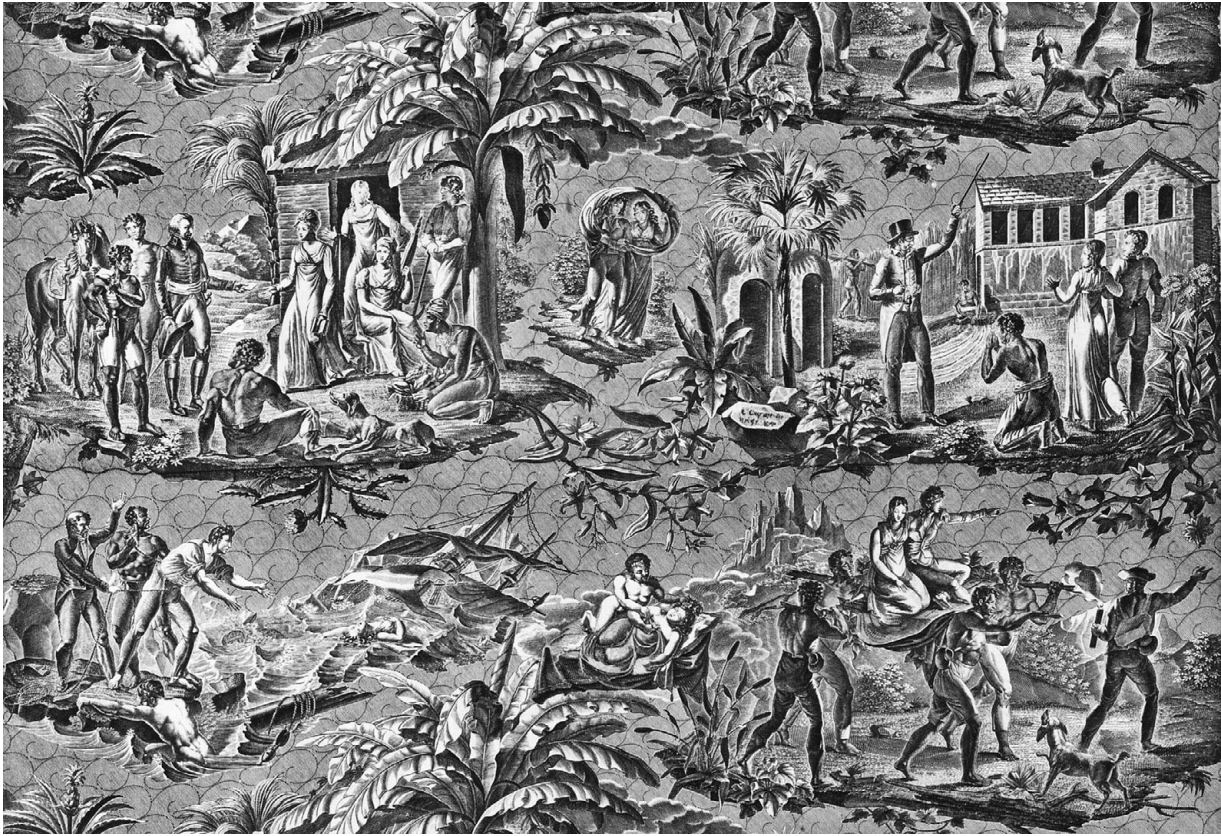
Figure 4.2 Scenes from Paul et Virginie , after Charles Chasselat and Antoine Johannot (1825–1830).