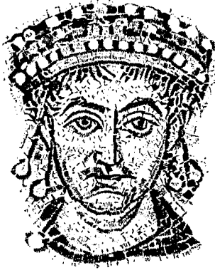
JUSTINIAN THE GREAT. (From the mosaic in S. Vitale, Ravenna)