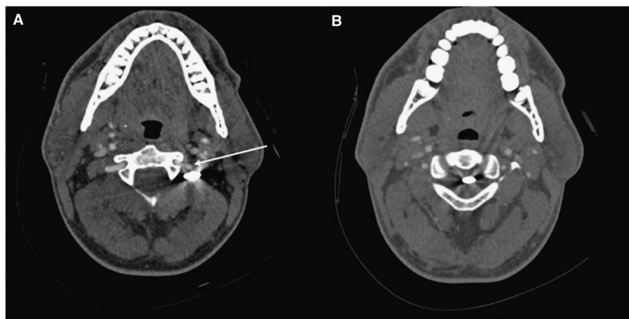
Figure 1: Axial CT Angiogram of the Neck A: Axial CT-Angiogram displaying proximity of nail to the left vertebral artery as it exits the foramen transversarium at C2. The white arrow indicates the left vertebral artery. B: Axial CT-Angiogram displaying the tip of the nail in the center of the spinal canal between C1 and C2.

Penetrating neck injuries account for approximately 5% to 10% of all trauma admissions. 1 Given the intimate relationship of the numerous vital structures in the neck, penetrating wounds may result in devastating injury to vital vascular and neurological structures as well as to the trachea and esophagus. Penetrating neck injuries are associated with vascular injury in approximately 25% of cases. Remarkably, overall mortality is low ranging from 0% to 11% in various series. 2,3 In a review of 130 patients with penetrating neck injuries presenting to our centre, knife stabbings were identified as the most common mechanism of penetrating neck injury occurring in 79 patients. 4 Nail-gun injuries to the neck are uncommon occurrences. This case provides an interesting and rare imaging finding demonstrating a nail situated in the spinal canal of a patient with no neurological compromise.