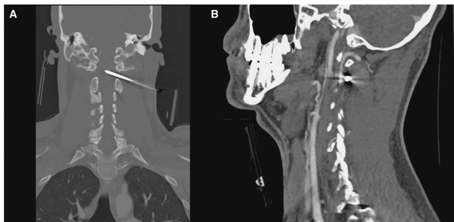
Figure 2: Coronal and Sagittal CT-Angiogram Images A: Coronal CT-Angiogram displaying bone windowing with the trajectory of the nail seen. The nail tip is located in the center of the spinal canal at the level of C1-C2. B: Sagittal CT-Angiogram displaying the proximity of the nail to the ascending left vertebral artery, with the nail passing posterior to the vessel.