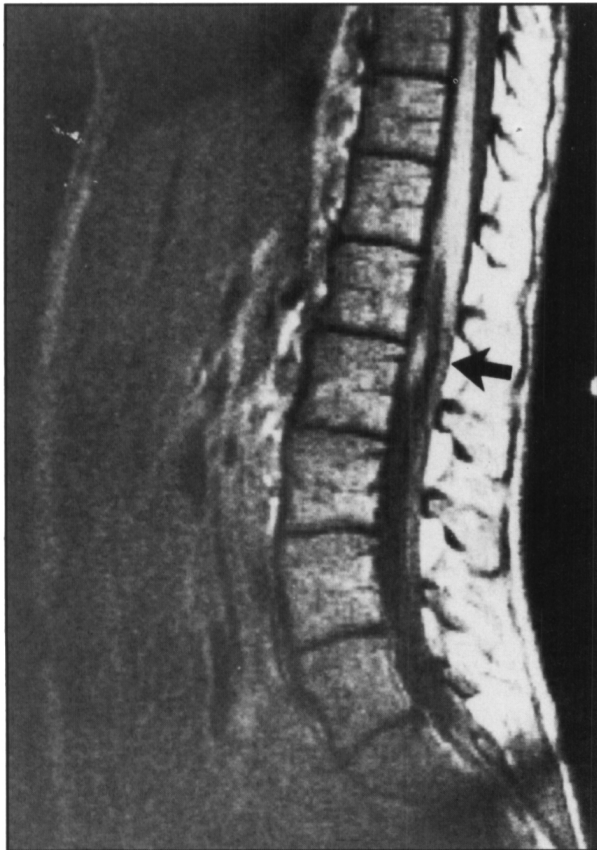
Figure 1 — T1 weighted sagittal sequence magnetic resonance image of thoracolumbar spine showing an oval area of high signal density representing a mass within the cauda equina anteriorly (arrow).

No lymphoma was present outside of the nervous system. A diffuse abdominal Mycobacterium avium intracellulare infection and bilateral Candida albicans pneumonia were present. A plaque-like, partially necrotic tumor mass was infiltrating the upper lumbar spinal cord posteriorly. Adjacent, partially necrotic nerve roots were encased in and infiltrated by the tumor (Figure 2). Microscopic and immunohistochemical examination showed features similar to those found in the surgical biopsy. Within the brain, multiple necrotic tumor masses (0.03-0.06 cm 3 ) were attached to the ventricular surface of a thickened septum pellucidum. In the basal ganglia, thalamus and corpus