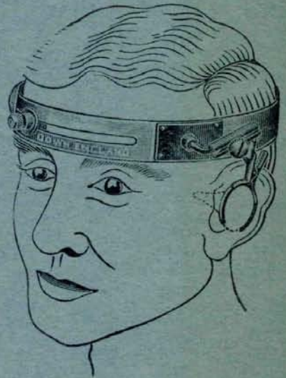
Michelson's Ear Speculum Holder

Further details of our range of Stapedectomy Instruments on application