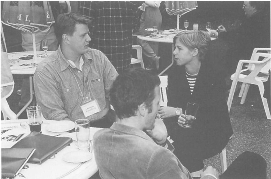
Animated conversations at the opening reception.