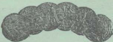
Gold Medal Allahabad 1910.

Paris 1900, Brussels 1910, Buenos Aires 1910.