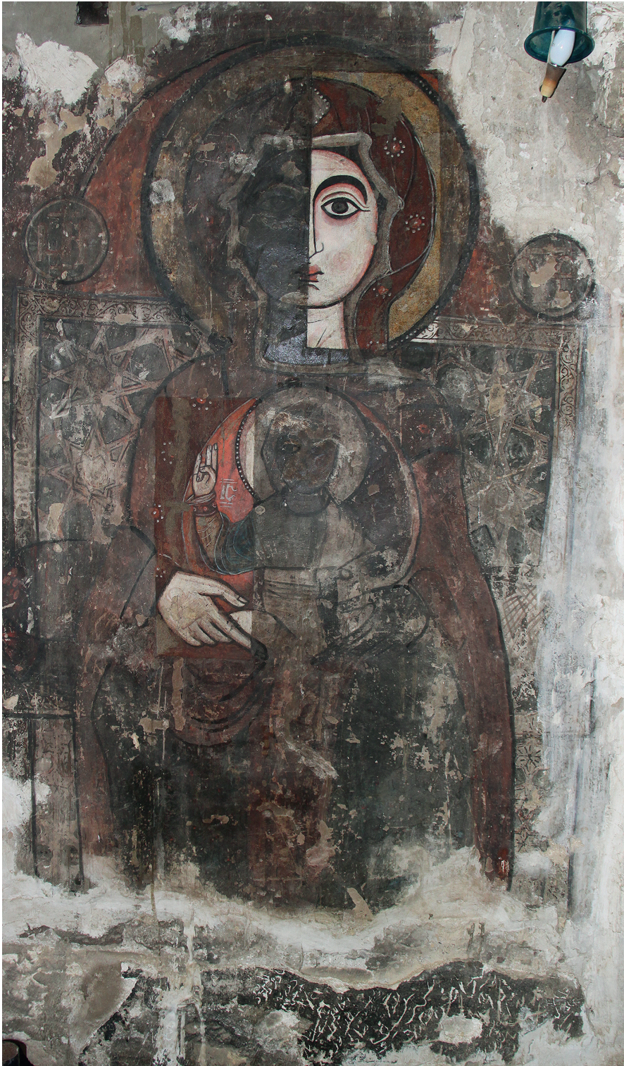
1.1. Theotokos during conservation, sanctuary, White Monastery Church. Secco painting, c. early fourteenth century.