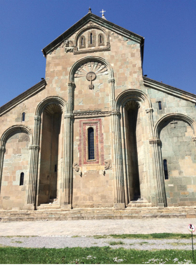
1.15. East façade, Svetitskhoveli Cathedral, Mtskheta, Georgia, eleventh century.

more firmly to its Near Eastern context. At the same time, the imprint of the Roman Empire on the Near East, even in memory, is indelible. Byzantine authority was linked to emperor and patriarch throughout, and we lose something if we ignore the role played by the Byzantine Empire and the Orthodox Church in Europe and the Near East alike. 59 That said, the notion of “Byzantium,” in its fullest sense, is a moving target. The Roman legacy is only one part of its role in shaping the Near East, both Christian and not. Highly diverse topics – yeshivot , Egyptian monasteries, liturgical objects, Jerusalem liturgy, Islamic origins – all fall under the purview of Byzantine Studies precisely because they depend, in part, on Byzantine categories for their existence and preservation and, crucially, for their study today.