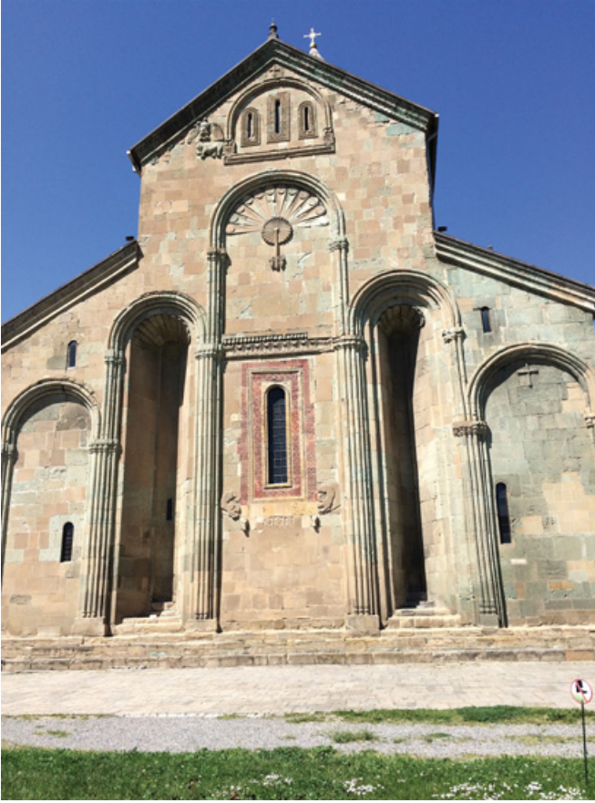
1.15. East facade, Svetitskhoveli Cathedral, Mtskheta, Georgia, eleventh century.

more firmly to its Near Eastern context. At the same time, the imprint of the Roman Empire on the Near East, even in memory, is indelible. Byzantine authority was linked to emperor and patriarch throughout, and we lose something if we ignore the role played by the Byzantine Empire and the Orthodox Church in Europe and the Near East alike. 59 That said, the notion of “Byzantium,” in its fullest sense, is a moving target. The Roman legacy is only one part of its role in shaping the Near East, both Christian and not. Highly diverse topics – yeshivot , Egyptian monasteries, liturgical objects, Jerusalem liturgy, Islamic origins – all fall under the purview of Byzantine Studies precisely because they depend, in part, on Byzantine categories for their existence and preservation and, crucially, for their study today.