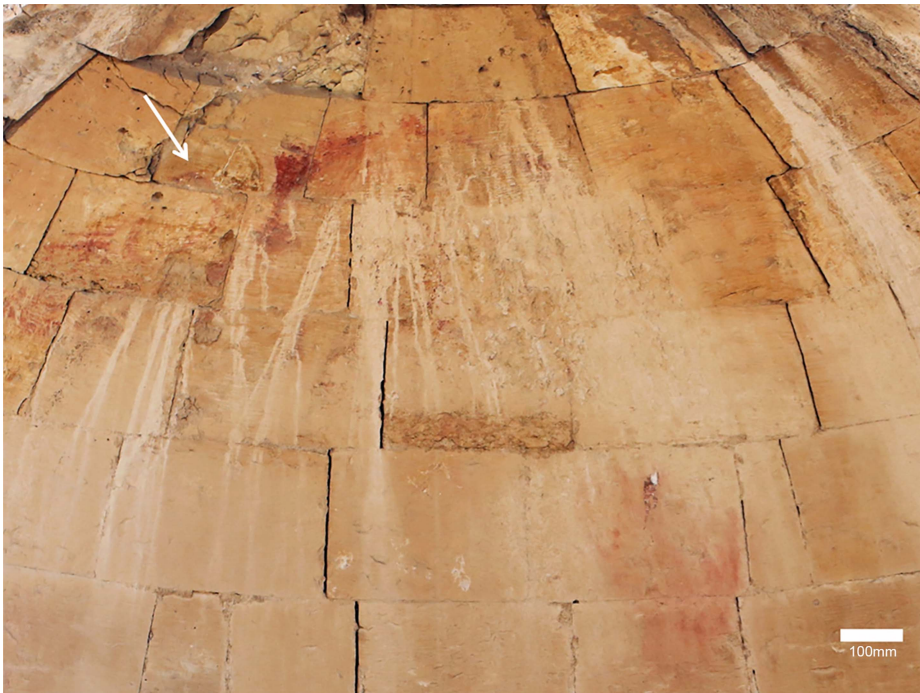
Figure 4. Remnants of the baptism-of-Christ scene (indicated by white arrow) on the apse of the Baptistry chamber.