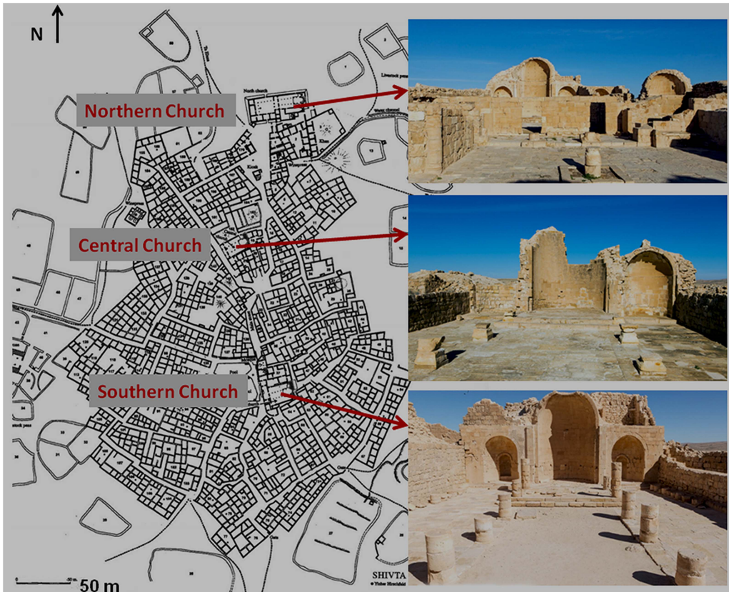
Figure 1. Plan of Shivta, with the location of its three churches shown (site plan amended from Hirschfeld 2003: fig. 3).