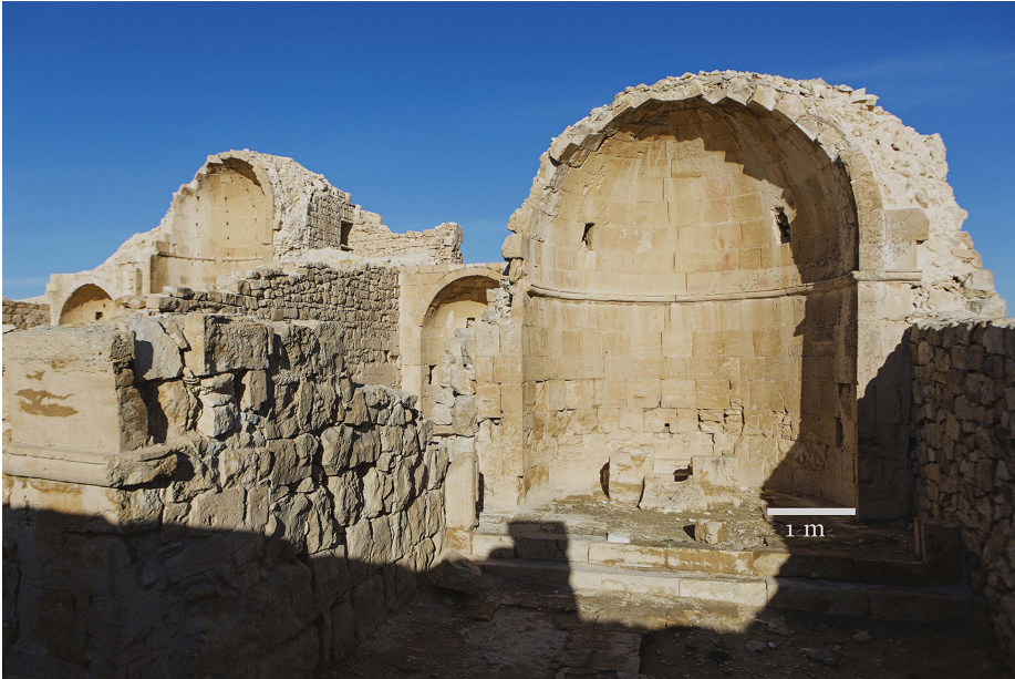
Figure 3. The Baptistry chamber beside the Northern Church, Shivta.