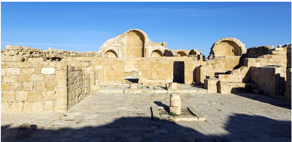
Figure 2. The Northern Church, Shivta.