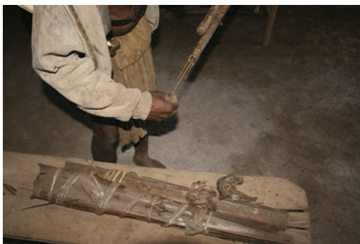
Figure 4. An inhabitant showing how he keeps his feathers secure in tubes to prevent the feathers from wearing out (Munima clan, Southern Highlands Province, PNG, June, 2008;).

More research should be conducted on the collection and trade of the BBOP in more areas and for longer periods of time, so that nationwide trends can be fully understood. Also, research is needed to better understand the effects of deforestation. BBOP observations and interviews during this research suggest that the bird's reported poor tolerance of habitat degradation (BirdLife International 2000, Bird in litt. ) may be over-estimated (certainly with regards to foraging), which warrants a further investigation to verify or invalidate this statement. Lastly, more research is needed on the bird's population (distribution, density, size and trends) and reproduction rate. This combined research would help to better understand the ecological sustainability of collection and to determine hunting thresholds in particular areas.