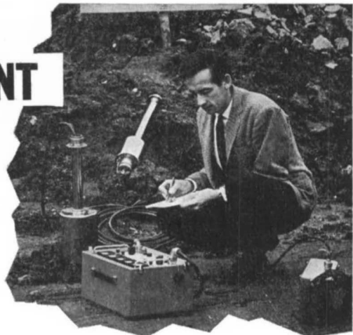
Taking moisture measurements with NE 8401

In addition to being in use in road, coal and agricultural research establishments and in industry in Britain, NE8401