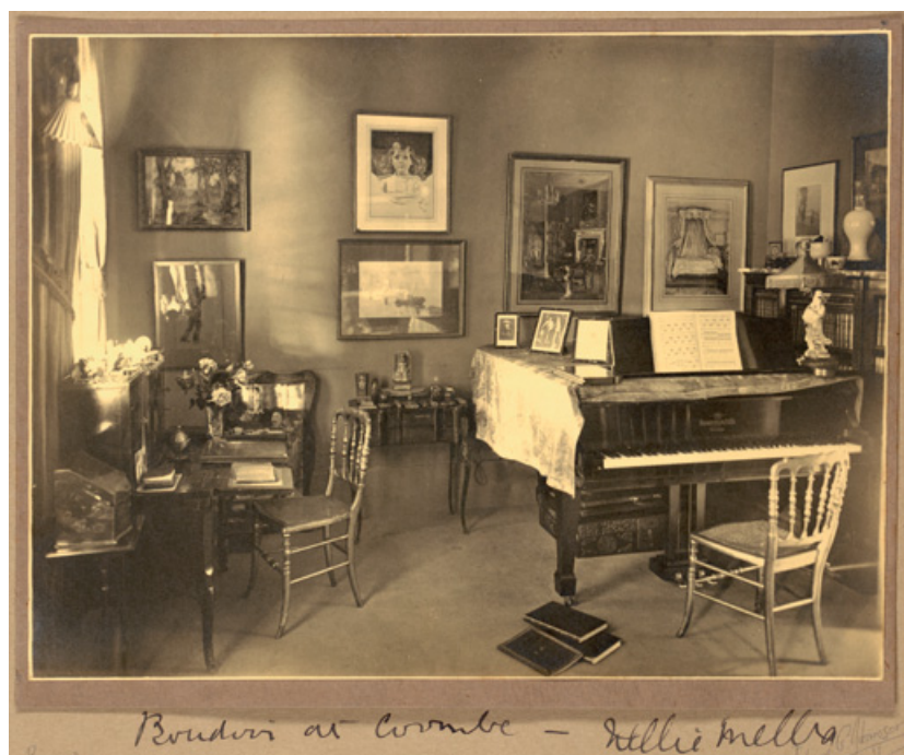
Figure 6 ‘Boudoir at Coombe’, Coombe Cottage, Coldstream, near Lilydale, Victoria, home of Dame Nellie Melba

into a warm and welcoming community of artists embedded in a small village atmosphere which was like her own home in Kent.