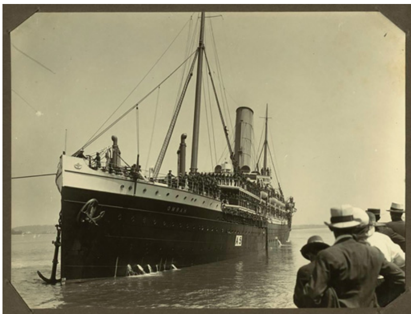
Figure 2 'Orient Steam Navigation Company liner Omrah in Brisbane in 1914', (no date)

Terry sailed on the SS Omrah from London to Melbourne via Naples, Port Said, Suez and Colombo (see Figure 2). She landed in Fremantle in Western Australia before continuing by sea around the southern coast of Australia to Melbourne. There she gave three performances at the Town Hall on the 7th, 9th, and 11th of May. She continued north to Sydney by rail where she gave three more lectures at the Town Hall on the 14th, 16th, and 18th of May, and then travelled north again by rail to Brisbane for two more lectures on 21st and 23rd May, before returning to Sydney on 24th May.