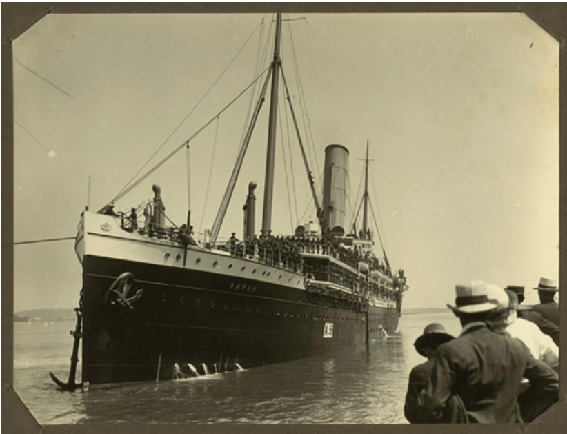
Figure 2 'Orient Steam Navigation Company liner Omrah in Brisbane in 1914', (no date)

Terry sailed on the SS Omrah from London to Melbourne via Naples, Port Said, Suez and Colombo (see Figure 2). She landed in Fremantle in Western Australia before continuing by sea around the southern coast of Australia to Melbourne. There she gave three performances at the Town Hall on the 7th, 9th, and 11th of May. She continued north to Sydney by rail where she gave three more lectures at the Town Hall on the 14th, 16th, and 18th of May, and then travelled north again by rail to Brisbane for two more lectures on 21st and 23rd May, before returning to Sydney on 24th May.