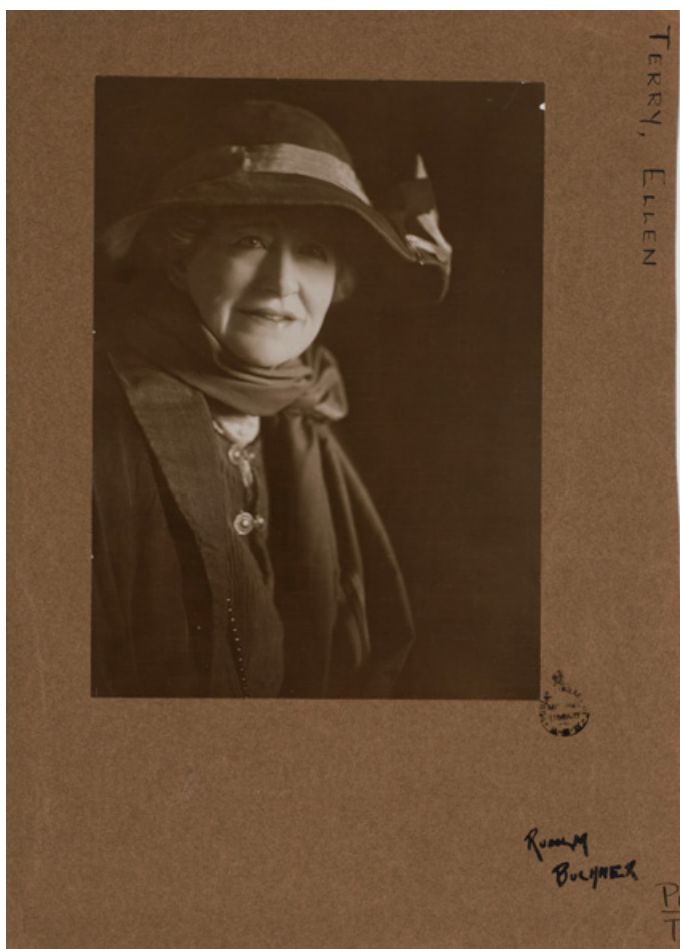
Figure 1 ‘Ellen Terry, English actor’, 1914, Rudolph Buchner (photographer), State Library of NSW: Sydney, Australia, P1/1739; https://collection.sl.nsw.gov.au/record/93QVrDN1 (Out of copyright: created before 1955)

struggle for women’s suffrage. Her friendship with international opera star, Nellie Melba, is unveiled as a sustaining bond that transforms foreign soil into a relational space of solidarity.