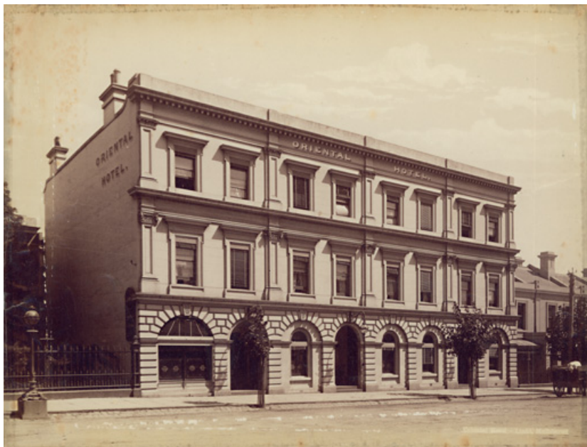
Figure 3 ‘Oriental Hotel’, Collins Street, Melbourne, Vic.

had surgery at the New York Eye and Ear Infirmary to restore her failing eyesight. 19 On the 1st of May she boarded the SS New York in New York, and sailed for Liverpool, finally arriving in London to be reunited with her family and friends. 20