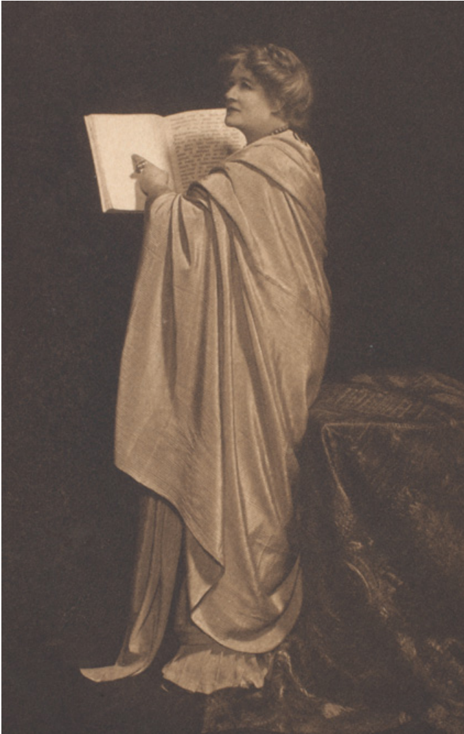
Figure 4 ‘Ellen Terry during her lecture tour’, England, 20th century, © Victoria and Albert Museum, London. (Licence Purchased).

composed to be heard, not to be read’, and St John, ‘agreed that without the improvisations she made when she was lecturing, without the illumination of her ideas provided by her acting of the interpolated scenes, her lectures would be only half themselves’. 71