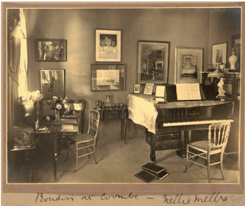
Figure 6 ‘Boudoir at Coombe’, Coombe Cottage, Coldstream, near Lilydale, Victoria, home of Dame Nellie Melba;.

into a warm and welcoming community of artists embedded in a small village atmosphere which was like her own home in Kent.