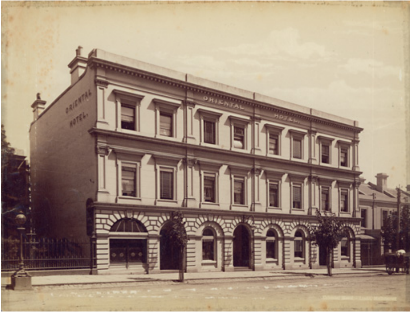
Figure 3 ‘Oriental Hotel’, Collins Street, Melbourne, Vic.

had surgery at the New York Eye and Ear Infirmary to restore her failing eyesight. 19 On the 1st of May she boarded the SS New York in New York, and sailed for Liverpool, finally arriving in London to be reunited with her family and friends. 20