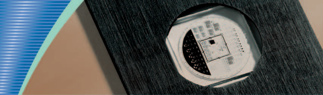
Low Magnification Image