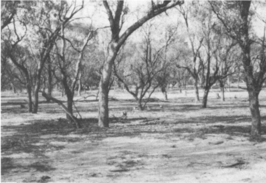
Riverain woodland, Hattah-Kulkyne National Park, June 1983 (David Cheal).

number of inadvertent deaths, and was ineffective in achieving the necessary population reduction inside the Paddock. Culling remained the only practicable humane method to reduce the grazing pressure. In August 1984, 787 kangaroos in the Moumpall Paddock were shot by carefully supervised professional shooters and the carcasses buried. In July 1984, the total population for the Moumpall Paddock was estimated as 1620 western grey kangaroos. Thus, their estimated density after the cull is about 14.6 per sq km. There is no attempt to eliminate western grey kangaroos from the Park or from the Moumpall Paddock—merely to reduce their numbers to a level that would permit vegetation regeneration and survival of its dependent biota. The carcasses and skins do not leave the Park and thus do not enter the commercial kangaroo industry (kangaroos are not killed for commercial purposes in Victoria).