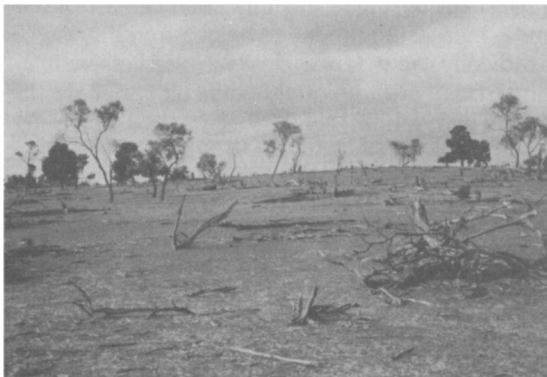
Degraded woodland with remnant Callitris preissii (Cupressaceae) and Hakea tephrosperma (Proteaceae).