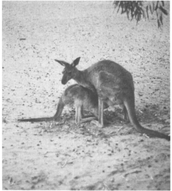
Western grey kangaroos. Hattah-Kulkyne National Park, February 1983. Note the lack of herbaceous cover and abundance of kangaroo faeces (A. Mitchell).

Once the grazing pressure has been reduced, it is expected that spontaneous vegetation regeneration will be sufficient to restore near-original vegetation communities to most of the Park's (former) woodlands. However, over broad areas even the last few trees and shrubs have been eliminated and there is no longer a local seed source. In such situations the woody species may need to be reintroduced by planting young seedlings grown from locally collected seed. Where vegetation degradation has been so severe that mobile dunes have developed and spread, soil conservation works have proved necessary.