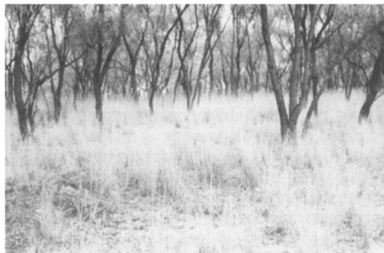
Riverain woodland, Kings Billabong, June 1983. There is significantly lower grazing pressure here than in Hattah-Kulkyne National Park (David Cheal).

The removal of stock from the Park and the great reduction of rabbits within the Moumpall Paddock reduced the variety of grazing animals, but did not significantly reduce the grazing pressure.