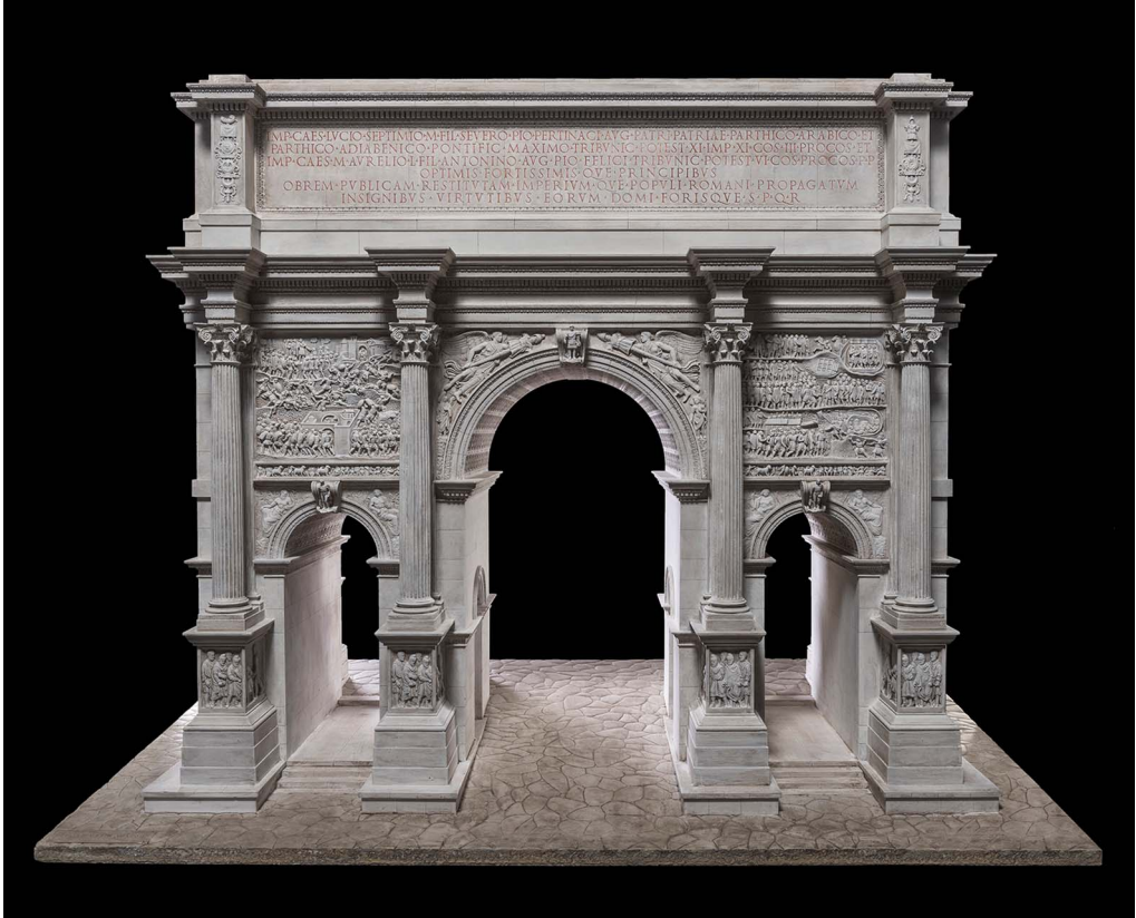
Figure 2. Arch of Septimius Severus in the Roman Forum (model), exhibited at the 'Mostra Augustea della Romanità' (1937–1938). Patinated alabaster gypsum; 1.14 × 1.44 × 0.84m; scale 1:20. Museo della Civiltà Romana (inv. MCR 468), Rome.

newly opened areas of the Forum and the Palatine, so neatly integrated into the exhibition, are intended to remain permanently accessible.