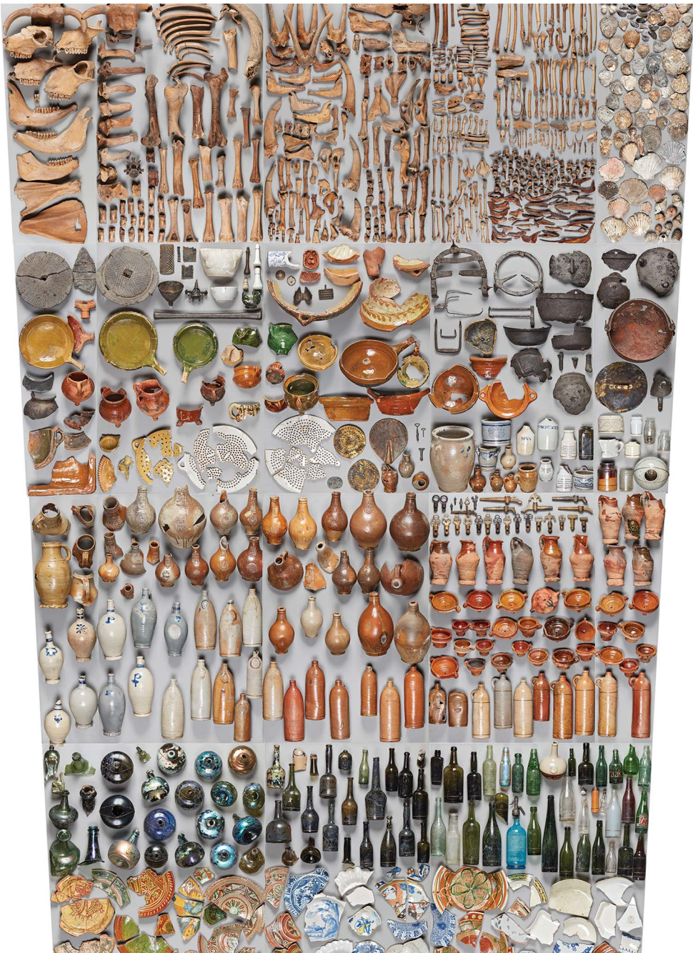
Frontispiece 1. Some of the 700 000 finds recovered by archaeologists between 2003 and 2012 during the construction of the Amsterdam North/South metro line. Construction of the stations at Damrak and Rokin involved excavation of the bed of the Amstel River, revealing an astonishing quantity and range of material culture, which included Neolithic stone axes and Bronze Age spearheads. Most of the material, however, relates to the development of the city of Amsterdam and is of late medieval and modern date, with objects ranging from ceramics to mobile phones. The finds from the investigations are on display at Rokin Station and can also be explored online at https://belowthesurface.amsterdam and via the 13 000 photographs in the catalogue Stuff by city archaeologists Jerzy Gawronski and Peter Kranendonk.