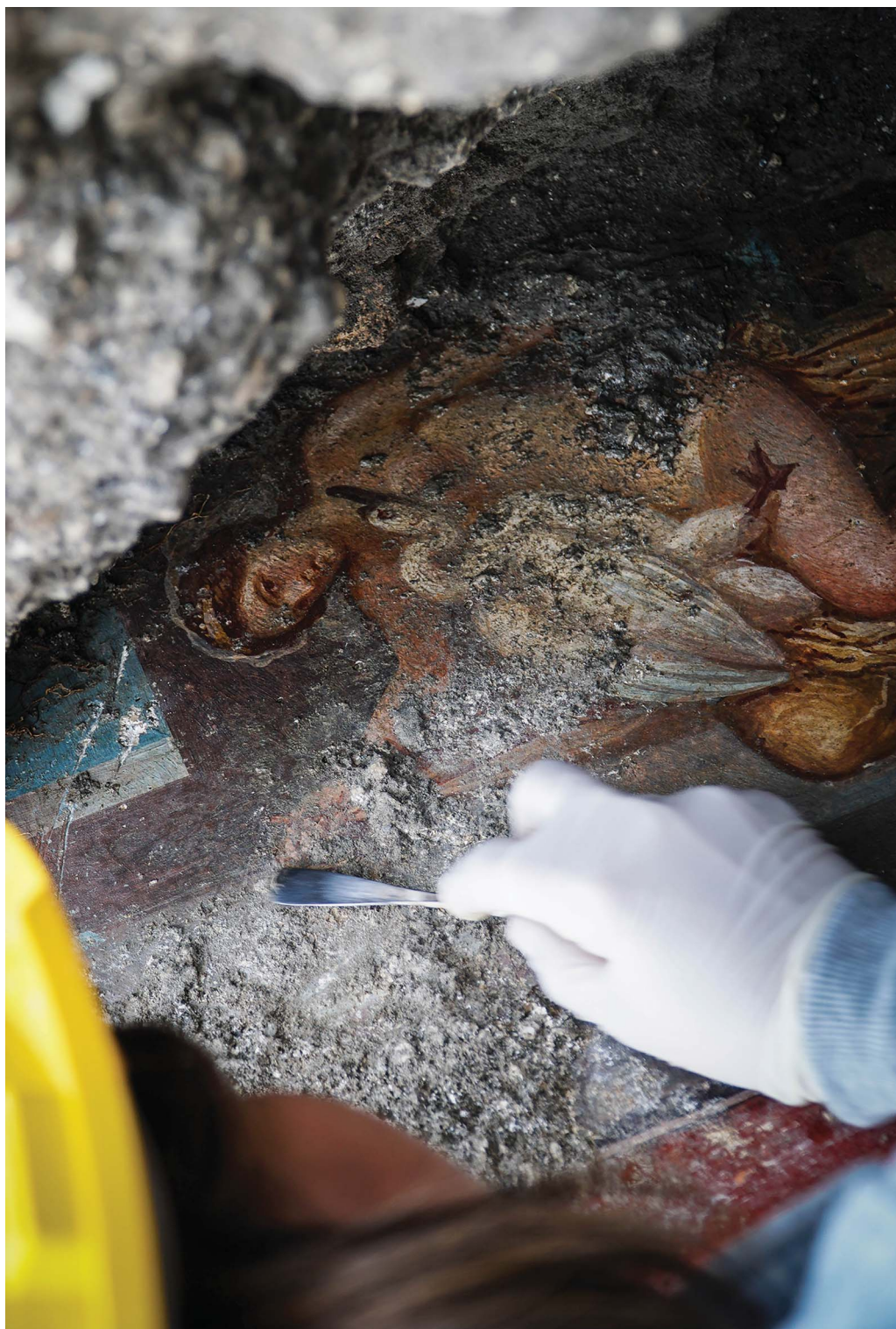
Frontispiece 2. A fresco depicting the mythological story of Leda and Zeus (in the form of a swan) is revealed during recent excavations at Pompeii. The wall painting was discovered in November 2018 in a wealthy domus in Regio V. The excavations form part of the €8.5-million, two-year 'Great Pompeii Project' designed to stabilise and conserve the site. After working through deposits associated with the nineteenth- and early twentieth-century excavations, which yielded numerous fragmented Roman-period finds discarded at that time, archaeologists have begun work on previously undisturbed eruption layers from AD 79. The project is the largest undertaken in the unexcavated area of Pompeii for over 50 years.