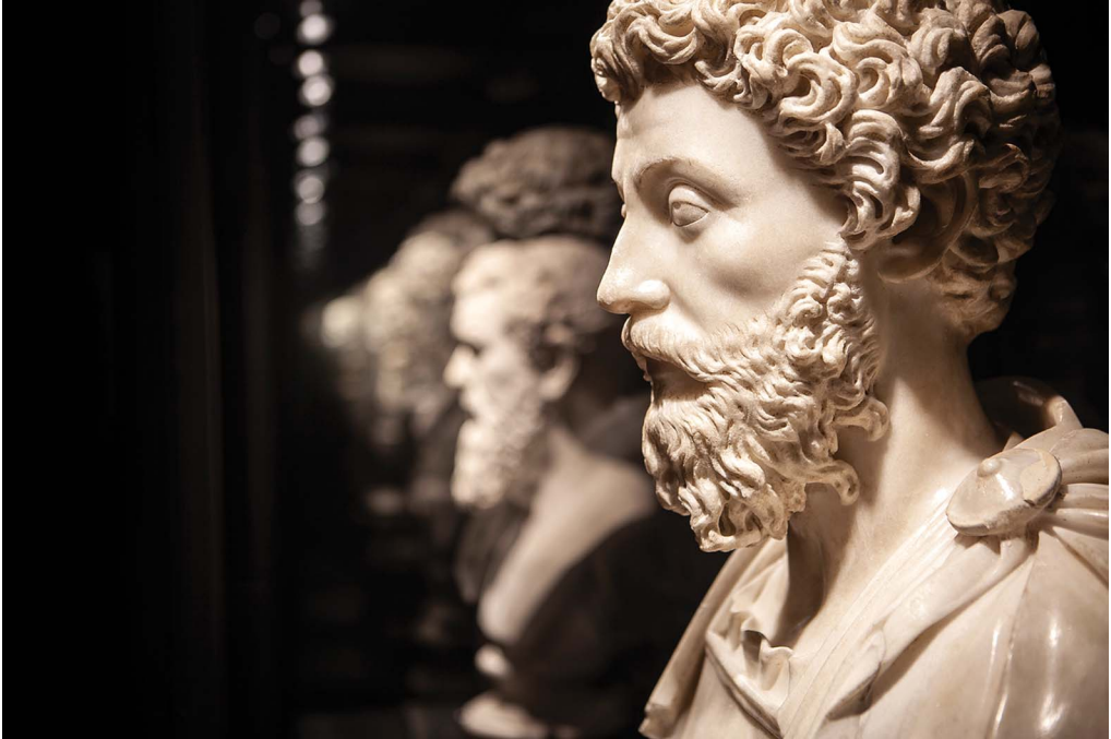
Figure 1. Marble bust of Septimius Severus on display at the Colosseum, 'Roma Universalis' exhibition.

fortunes for figures and regimes once considered absolutist or corrupt, and which have been used actively to advance political agendas. As if to make the point, 'Roma Universalis' features several plaster models originally created for display at the 'Mostra Augustea della Romanità' of 1937–1938, including one of the Arch of Septimius Severus (Figure 2). Divorced from the highly charged political context of their creation, these are simply illustrative models. But they also serve as a reminder of the ways in which archaeology, and the Roman past in particular, has been mobilised for political ends before. 'Roma Universalis' hints at its own political potential—for example, human rights and multiculturalism—but it does not tackle this head on. Given the heightened political tensions of our own troubled times, and the ghosts of European archaeology's earlier political entanglements, perhaps any more overt treatment might have been seen as 'too political'. And yet there is also a danger in not being explicit about the intended message of an exhibition showcasing the 'achievements' of a transcontinental empire headed by an authoritarian leader, backed by the military.