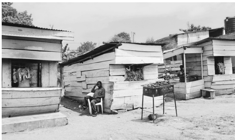
Figure 7.2 Pork products for sale in Mukono, Uganda, 2015.