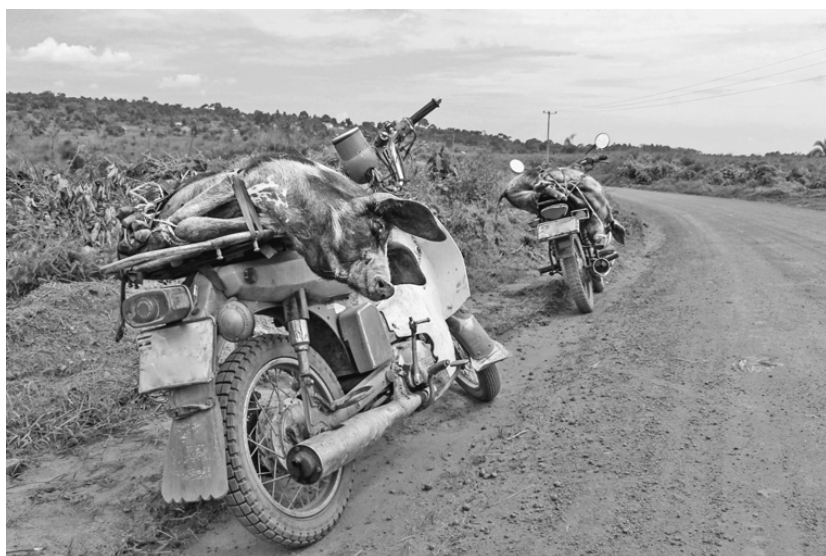
Figure 7.3 Transporting pigs by bike in Uganda, 2017.