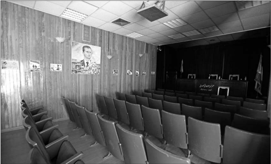
The interior of an Arabic Cultural Centre in a Syrian town.

Only one Syrian play was refused permission. In 1978, massive turmoil occurred at the Al-Hamra Theatre when members of the national leadership and secret police agencies stormed into the theatre to close Night of the Slaves by Mamdouh Adwan, directed by Naela Al-Atrash. The play was closed for its critique of the Al-Ba'ath party, using the emergence of Islam as a metaphor.