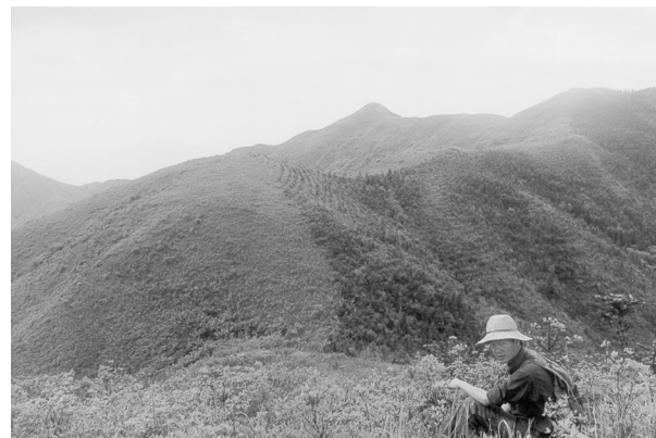
Plate 1 A westerly view of the core area of Yihuang South China Tiger Reserve.

Despite the reputed abundance of sightings and putative tiger traces reported, none could be confirmed and we failed to find any compelling evidence to indicate that