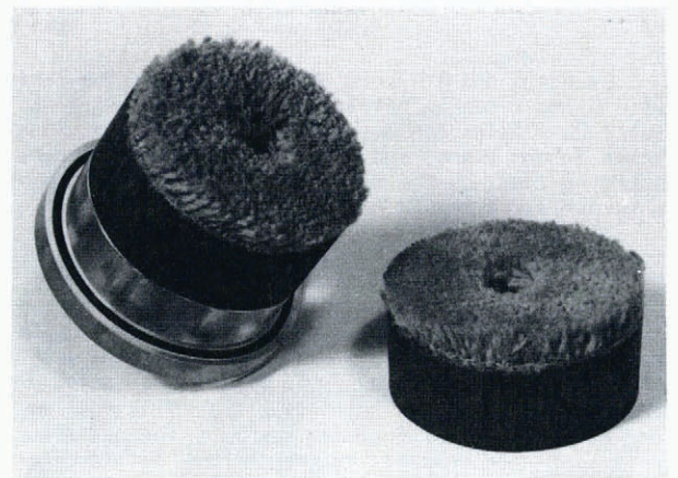
Fig. 2. Jute-backed carpet epoxied to Synthane end-caps.

*Now with ARCO Oil and Gas Company, Dallas, Texas, U.S.A.