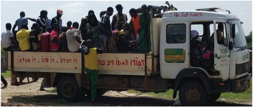
Figure 3. Truck emblazoned with kà kólɔn, kà báara, kà télen in Banamba.

The subtext behind this slogan is that N'ko activists regularly question the efficacy and work of those that currently staff and lead West African postcolonial states. Such discourse is of course common, but N'ko activists actively view themselves as offering an alternative work ethic. During the summer of 2013, for example, I visited a small Quranic school that operated in N'ko. After the lesson, during which students recited classical Arabic verses of the Quran transliterated into the N'ko script, we were visited by another N'ko activist whom I had been introduced to a few days prior, Yáyà Jàabí. Ethnically Soninke, he had spent eight years working in Angola. His good fortune during this time was manifested by the immaculate and air-conditioned vehicle that we eventually climbed into in order to run a few errands around town. Driving between his brother's business compound and our next destination, I commented on the