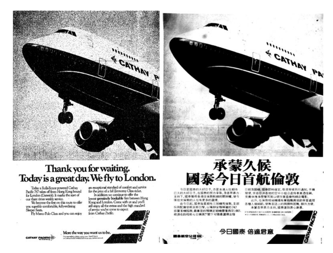
Figure 4. (a, b) "Thank you for waiting. Today is a great day. We fly to London."

our many friends elsewhere in the world," which had resulted in "Hong Kong's airline being granted the licence." As Cathay Pacific "moved beyond its traditional Asia-Australia-Middle East operating area," Miles pledged to maintain and enhance the reputation of the airline "of which Hong Kong is justly proud."