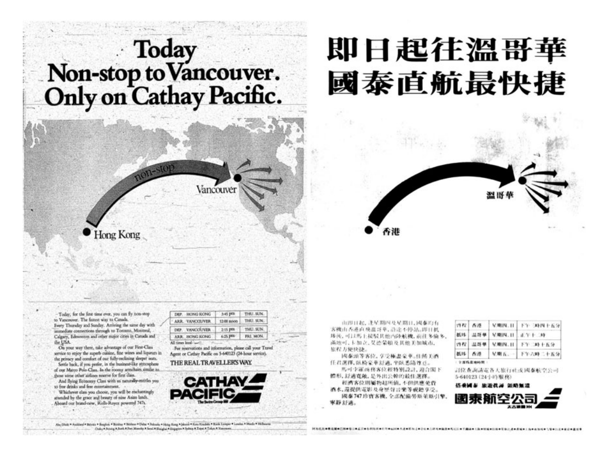
Figure 3. (a, b) "Today non-stop to Vancouver."