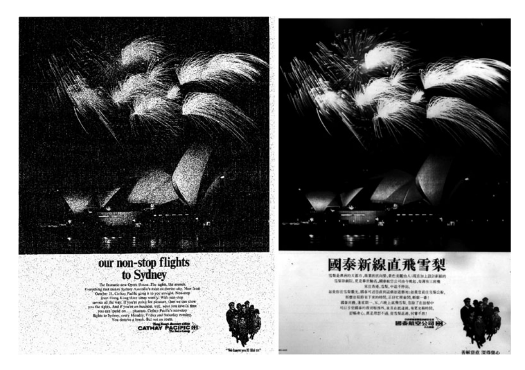
Figure 2. (a, b) "Our non-stop flights to Sydney."

advertisement. "But not en route" (Fig. 2a). The airline also placed advertisements in a local Chinese newspaper with similarly relentless references to its non-stop service (Fig. 2b).<sup>29</sup>