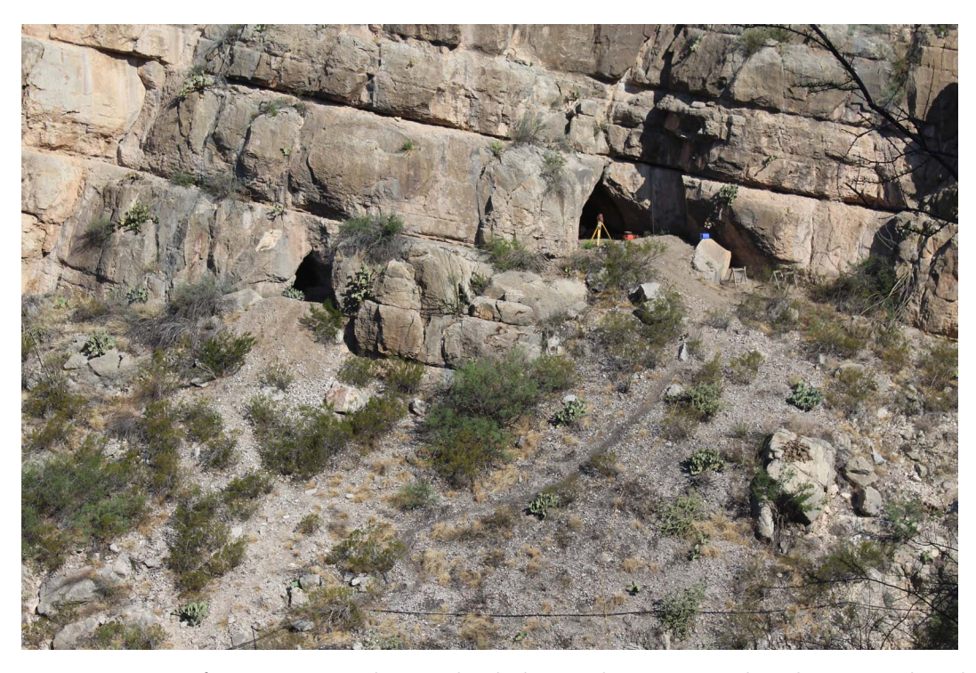
FIGURE 2. Overview of Spirit Eye Cave showing the dual triangular openings.

which pristine rockshelters are almost nonexistent (Mallouf 1996). For years, collectors have excavated hundreds of shelters to bedrock on the same 60,000-acre ranch where Spirit Eye Cave is located, and this scenario is repeated across West Texas. Although not ideal for conducting traditional field methods, the region offers a perfect laboratory for diachronic studies of both the social and economic variables that led to the destruction of these key sites—an important step forward in collector-based research.