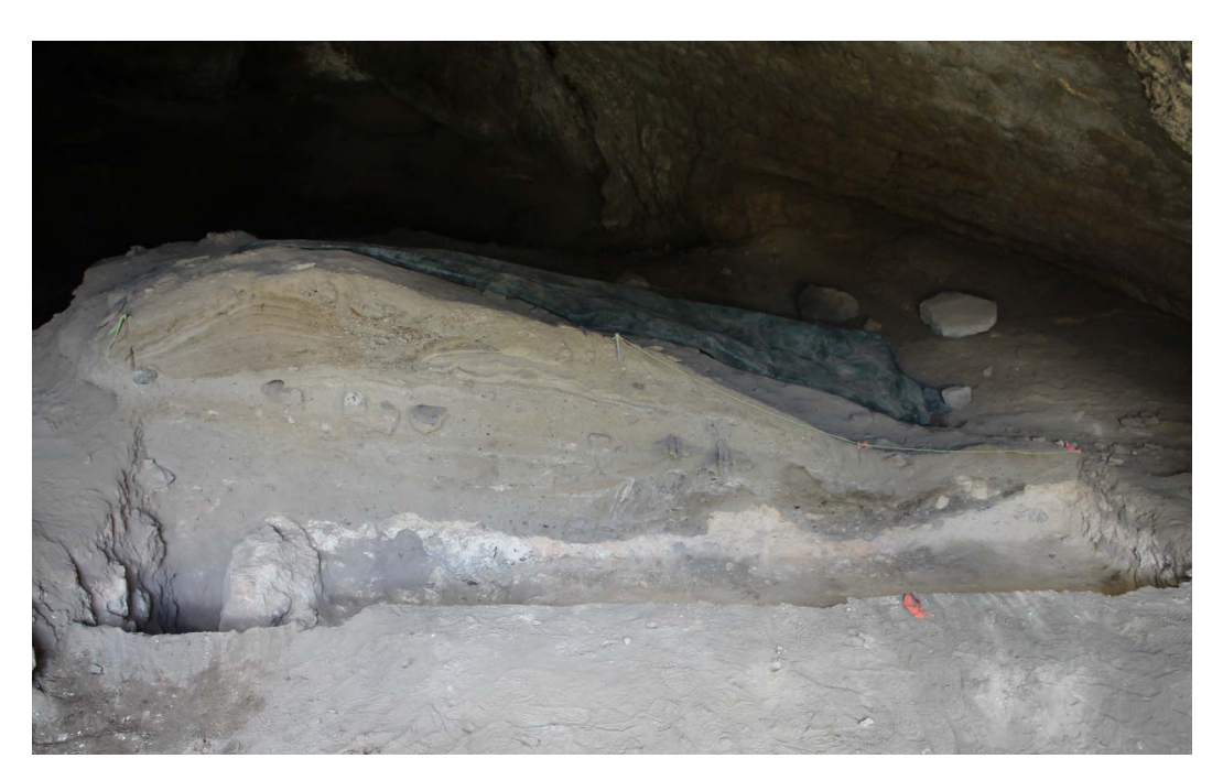
FIGURE 3. Profile of excavation at Spirit Eye Cave. All the laminated deposits are from screening by past collectors.

nine from private collections. All materials for radiocarbon dating were submitted to DirectAMS in Bothell, Washington. The goal of the radiocarbon dating was twofold. The first was to establish an occupational chronology for the site, because perishable artifacts were manufactured with short-lived plant species directly procured by cultural groups in the past. The second concerned the long-term care and accountability of the collection, especially regarding the human remains (Schroeder et al. 2021).