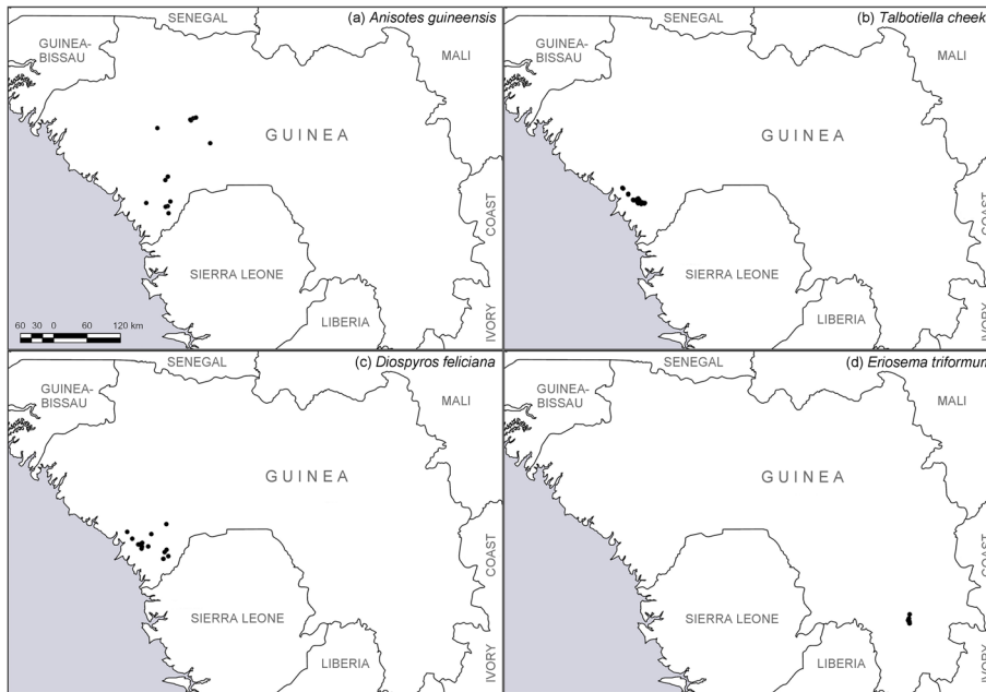
FIG. 1 The known distribution of four endemic Guinean species: (a) Anisotes guineensis , (b) Talbotiella cheekii , (c) Diospyros feliciana and (d) Eriosema triflorum .

Guinea (Supplementary Material 1) and 0.5% of its total flora. Of the 273 threatened species of the flora of Guinea (7% of the total number of species), 25% are woody (10% being widespread timber species) and the remainder are herbaceous or climbing species. In this pilot study we developed plans for eight woody species (including two widespread timber species) one climbing species and 11 herbaceous species. Eleven of these concern species endemic to Guinea; this represents 15% of the 77 plant species considered to be endemic. The over-representation of endemic species in our study reflects the concern of the working group to maximize the protection of those plant species for which Guinea has unique responsibility.