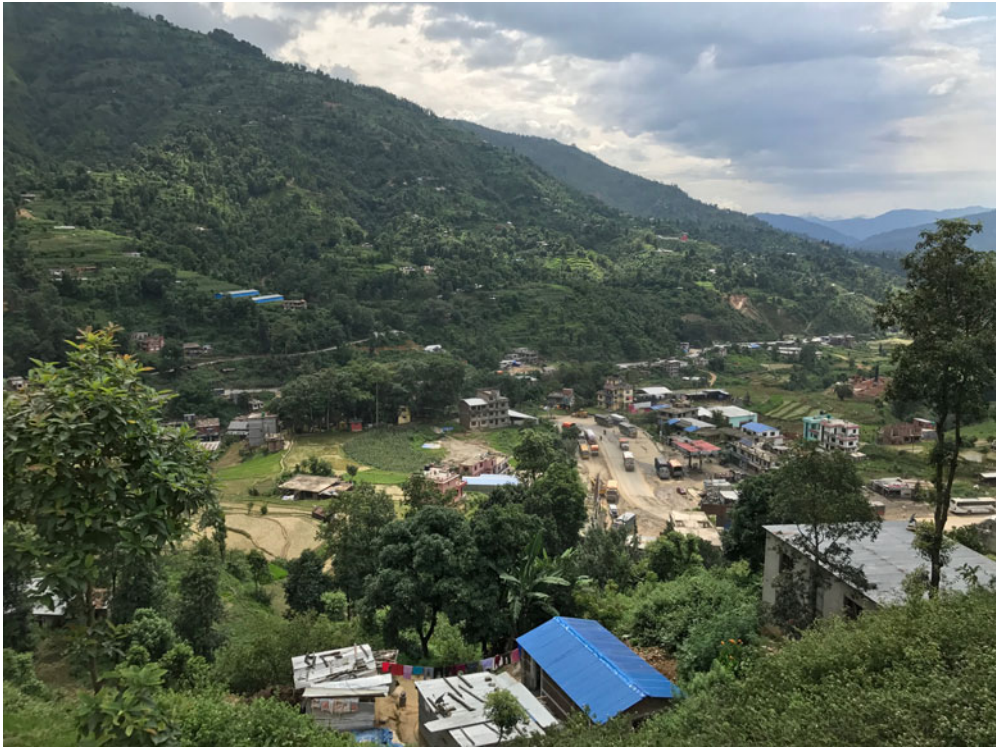
Figure 1. Image of the study site in Dhading, Nepal, showing the highway that passes through the town, terraced fields and hilly terrain.

(National Civil Code Act, 2017). Nepal does not legally allow marriage until age 20 for either men or women (National Civil Code Act, 2017). Most marriages adhere to this law, but it is not always well-enforced, especially in rural areas where marriages are not always registered with a government office.