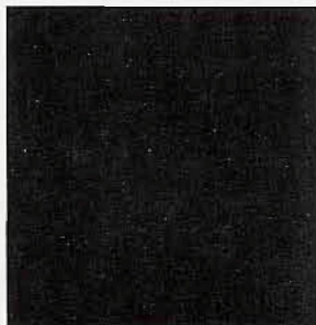
Figure 1. Artist's conception of what you likely saw the first time you looked in an optical microscope.

Now you are familiar with another pupil - the pupil of your eye, that organ that you see giving you a skeptical look every morning in the mirror. If you ignore its tendency to be critical and look at it closely, you find that the eye's pupil is a small black spot. Its main feature is that all the light coming into the eye must pass through it. It is actually the entrance pupil of the eye.