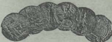
Gold Medal Allahabad 1910.

Paris 1900, Brussels 1910, Buenos Aires 1910.