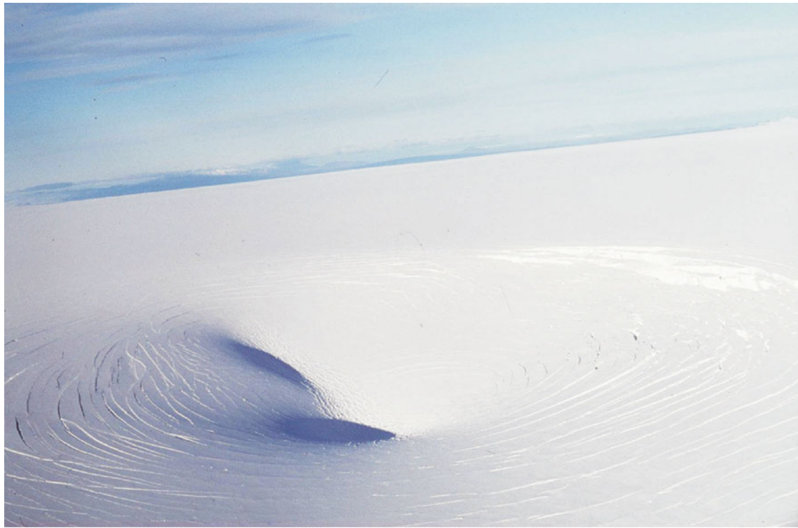
Fig. 1. An ice cauldron forming after the Gjalp eruption under Vatnajökull in 1996. The cauldron is about 2 km in diameter and hundreds of metres deep. Ring shear fractures can be seen, indicating yield of the ice. The subsidence rate of the ice surface was initially about 12 \text{ m h}^{-1} ; for further information see Guðmundsson and others (2004).

Finally, if the net volume flux out of the lake is Q , then