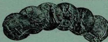
Gold Medal (Highest Award), Allahabad 1910.

GRANDS PRIX: Paris 1900, Brussels 1910, Buenos Aires 1910.