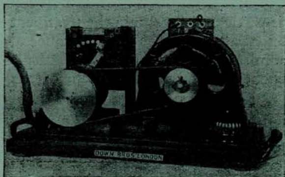
Rotary Blower with Electric Motor.

Printed and Published Monthly by ADLARD & SON, Bartholomew Press, Bartholomew Close, London, E.C