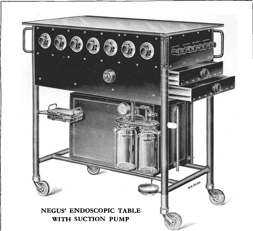
NEGUS' ENDOSCOPIC TABLE WITH SUCTION PUMP