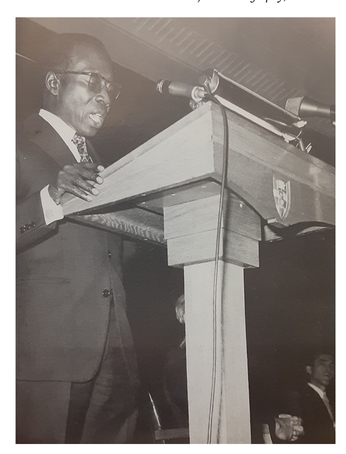
Figure 7. H. E. Léopold Sédar Senghor's presidential address at the Conference. Photo: Central Office of Information. From Manding Conference 1972: report and recommendations.

remarks at the conference.<sup>22</sup> Senghor's address also adds a significant element in French to the commemoration, which language is otherwise under-represented considering the nature of the conference. (Framing texts – preface, introduction, and acknowledgements – are in both English and French; other content is in its original language, either English or French.) Senghor's presidential address, with its reproduced first page of the typescript, also serves as a reminder of the over one hundred other contributions that make up the proceedings, represented only via a bibliography (Figures 7–8).