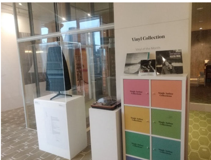
Fig. 3: The vinyl collection in the exhibition space.