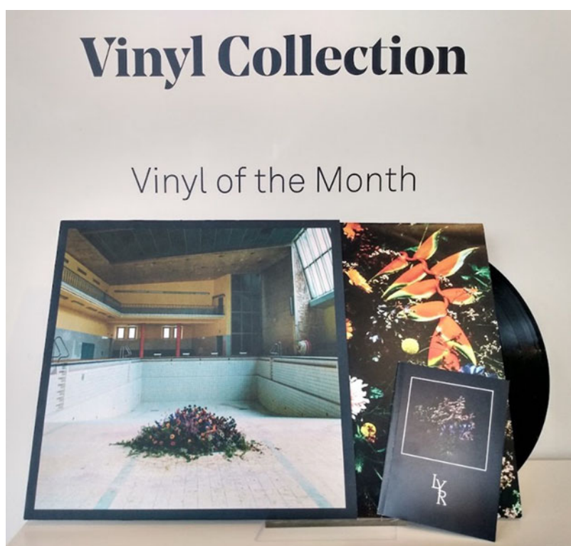
Fig. 6: 'Vinyl of the Month' display.

Once an annual budget had been set for building upon this collection, the library set about researching currently active record labels specialising in poetry, as well as identifying gaps in its collections. The net was cast wide, using information sources outside the library's usual channels, to ensure that these new acquisitions reflected the diversity of text and sound being produced, resulting in a huge range of new acquisitions on vinyl, both old and new. So far, these acquisitions have included an album by poet laureate Simon Armitage's band, a spoken word album by comedian Tim Key, reissues of albums by jazz poet Nikki Giovanni and Hungarian sound poet Katalin Ladik, and many more (Fig. 5 gives a sense of new material that the library has collected). Developing this collection has not only updated it to reflect current trends in recording and releasing poetry; it has