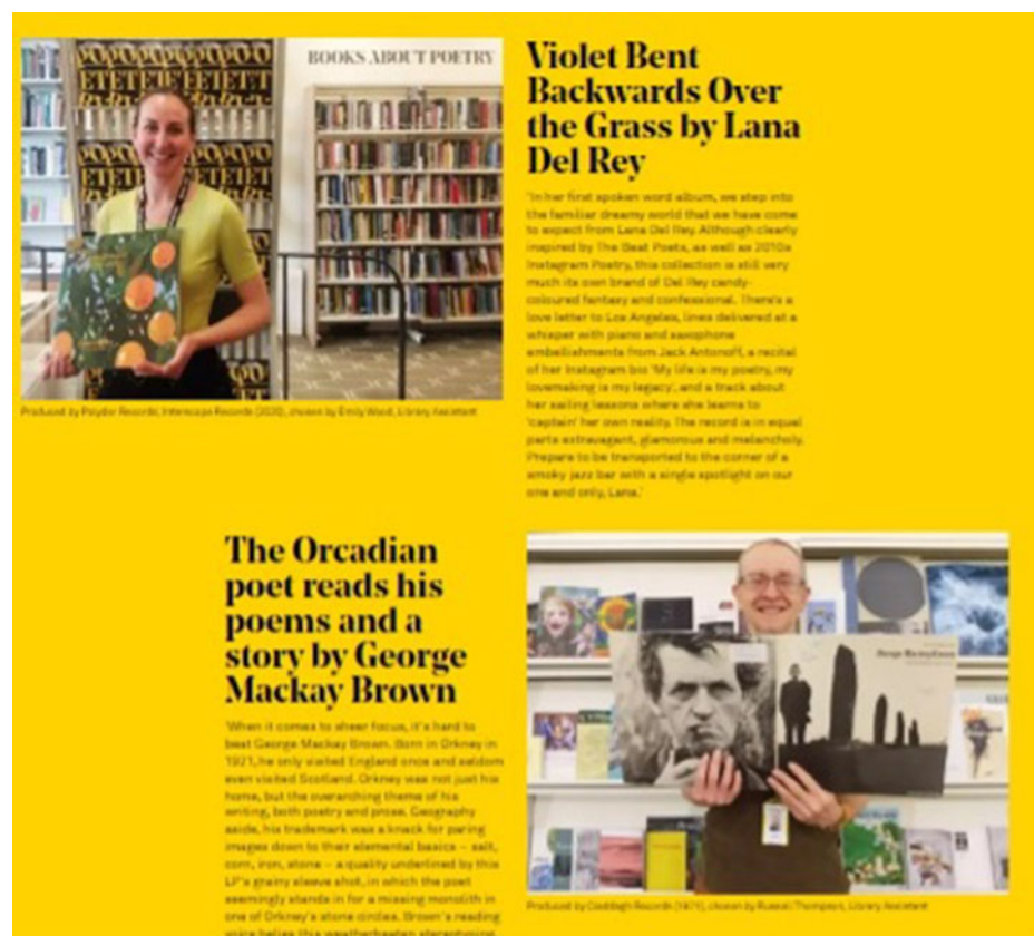
Fig 8: blog piece on the Southbank Centre website (Southbank Centre 2022).

with a regularly rotating 'Vinyl of the Month' display (Fig. 6). An effective visual signpost, this lets people know about the collection within the space of the library itself, and this will often be shared on social media.