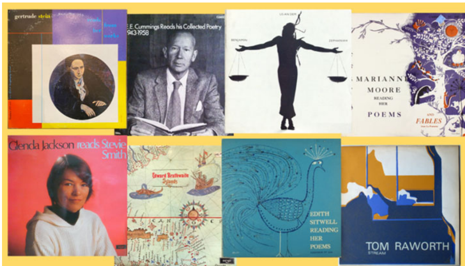
Fig. 4: Examples of historic items in vinyl collection.

This rich historic collection provided a solid foundation upon which to collect new poetry audio releases.