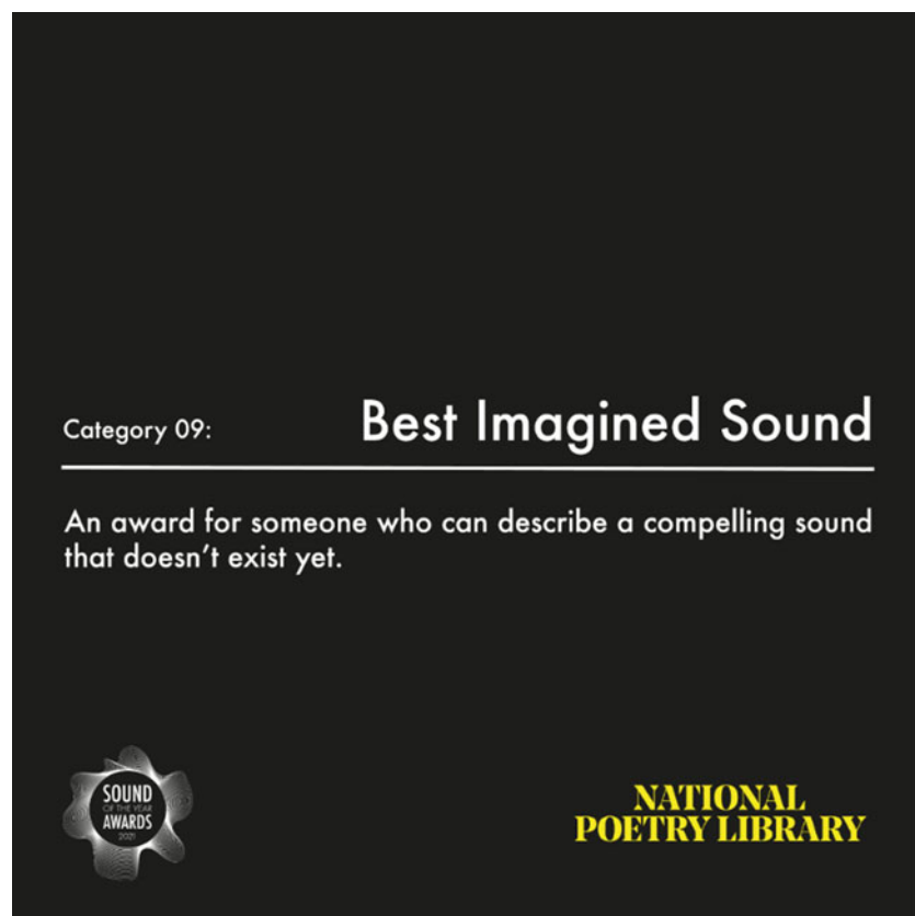
Fig. 10: Social media flyer for the Sound of the Year Awards' 'Best Imagined Sound' category.