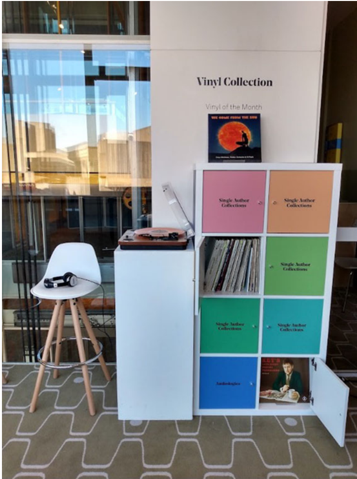
Fig. 2: New shelving for the library's LPs.