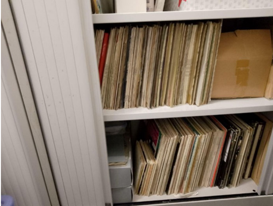
Fig. 1: LPs stored in cabinets in the library's Rare Books room.

Keeping the tactile, visual objects out of public reach was limiting the potential for engagement with this rich and wonderful resource. Although the aim was to eventually make the digitised audio content available, this was only really half the story. Restricting access to the record covers and liner notes, and fundamentally making this collection hard for people to find, or even to be aware of, limited its potential. It seemed that to raise awareness of this unique collection, the objects would need to speak for themselves on the shelves.