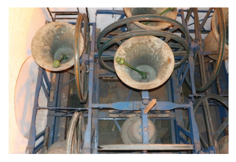
Figure 3. The bells of Christ Church Spitalfields and their wheels, 5 March 2023.

Searching for links between bell ringing and other kinds of performance, one chilly Sunday morning I went to the Barbican, a performing arts center in London. Built in the 1950s, this brutalist complex, comprising