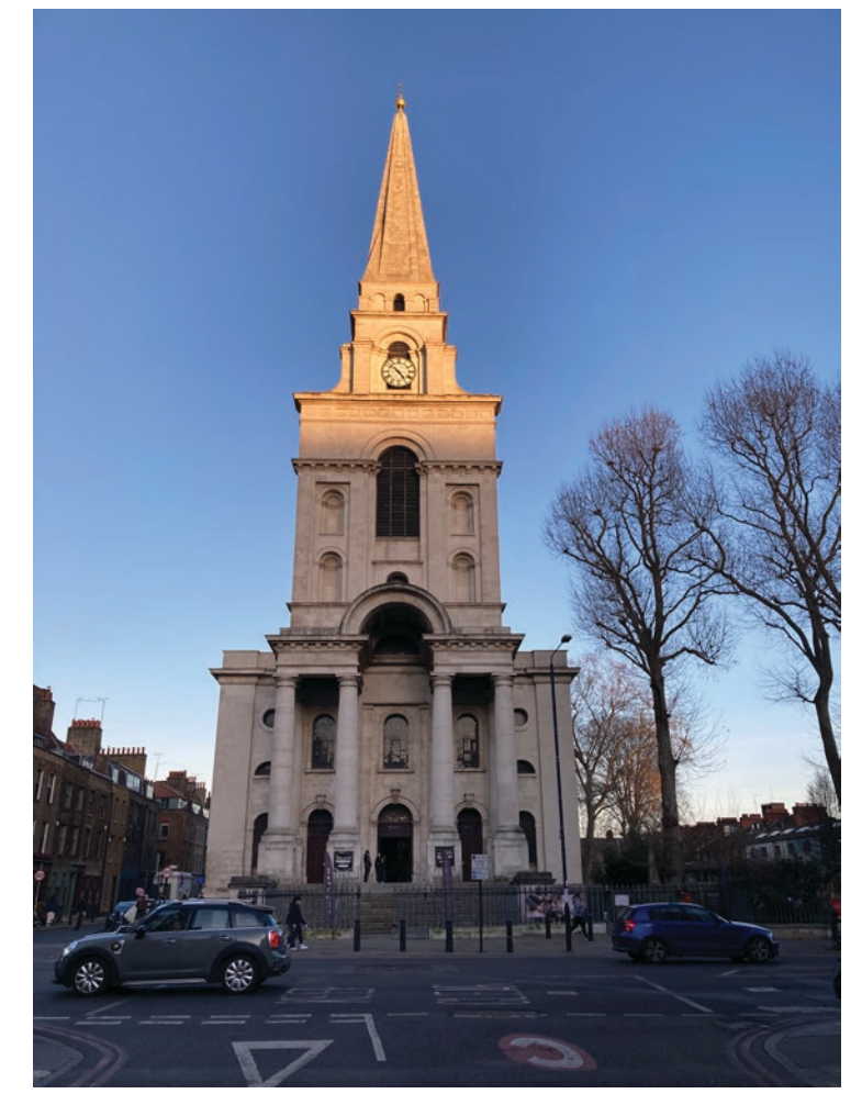
Figure 5. Christ Church Spitalfields, 5 March 2023.

"One of the peculiarities of the Exercise," Eisel writes, "is its current obsession with statistics and records" (1998:n.p.). The tower of St Martin's has several boards on its walls with details of record-breaking performances. This, too, is part of an age-old tradition. In March 1728, two ringing societies had a contest at St Martin's on recently installed